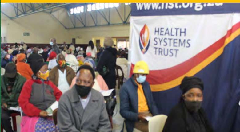
Community Members waiting to get vaccine at Mpumalanga Hall