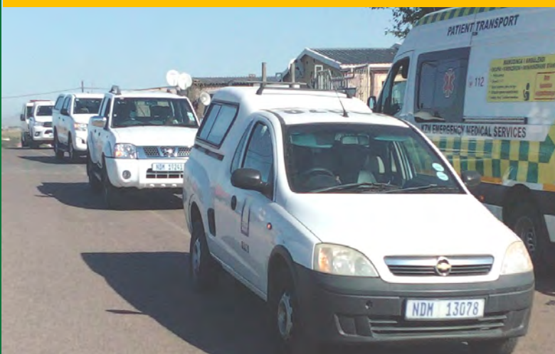
Motorcade to encourage the community to vaccinate for COVID 19