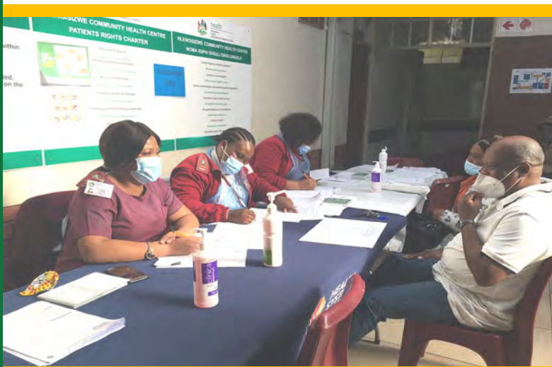
Hlengisizwe CHC staff conducting COVID 19 patient registration