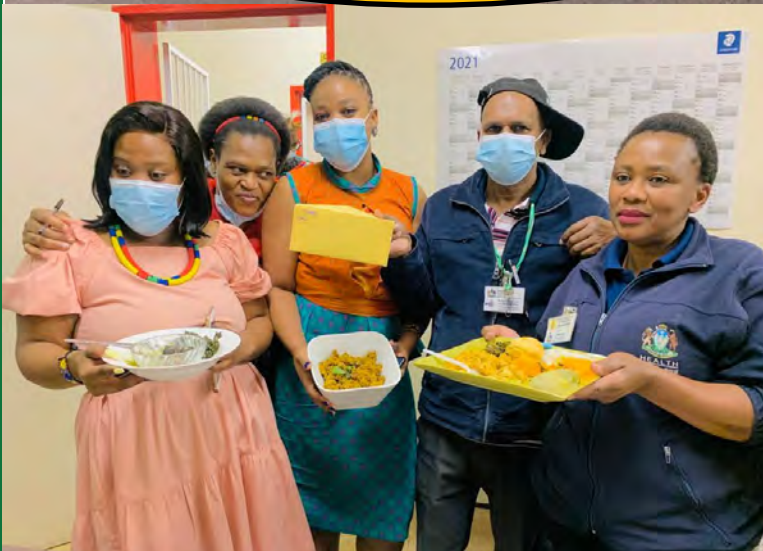
FOOD TESTING COMPETITION ENTRIES : HR & SYSTEMS DEPT.