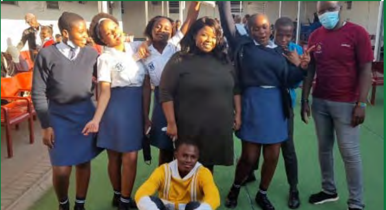
Youth celebrating during Hlengisizwe Community Health Centre Youth Day Event

H lengisizwe CHC hosted a successful Youth Day Celebration Event on the 19th of June 2021.