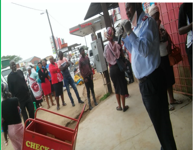
Untunjambili community awareness on COVID-19