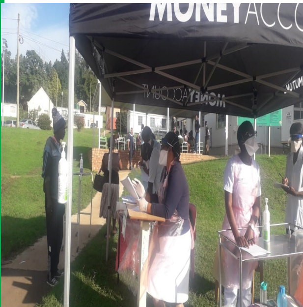
Umphumulo Hospital's patients and visitors COVID-19 Screening at the gate