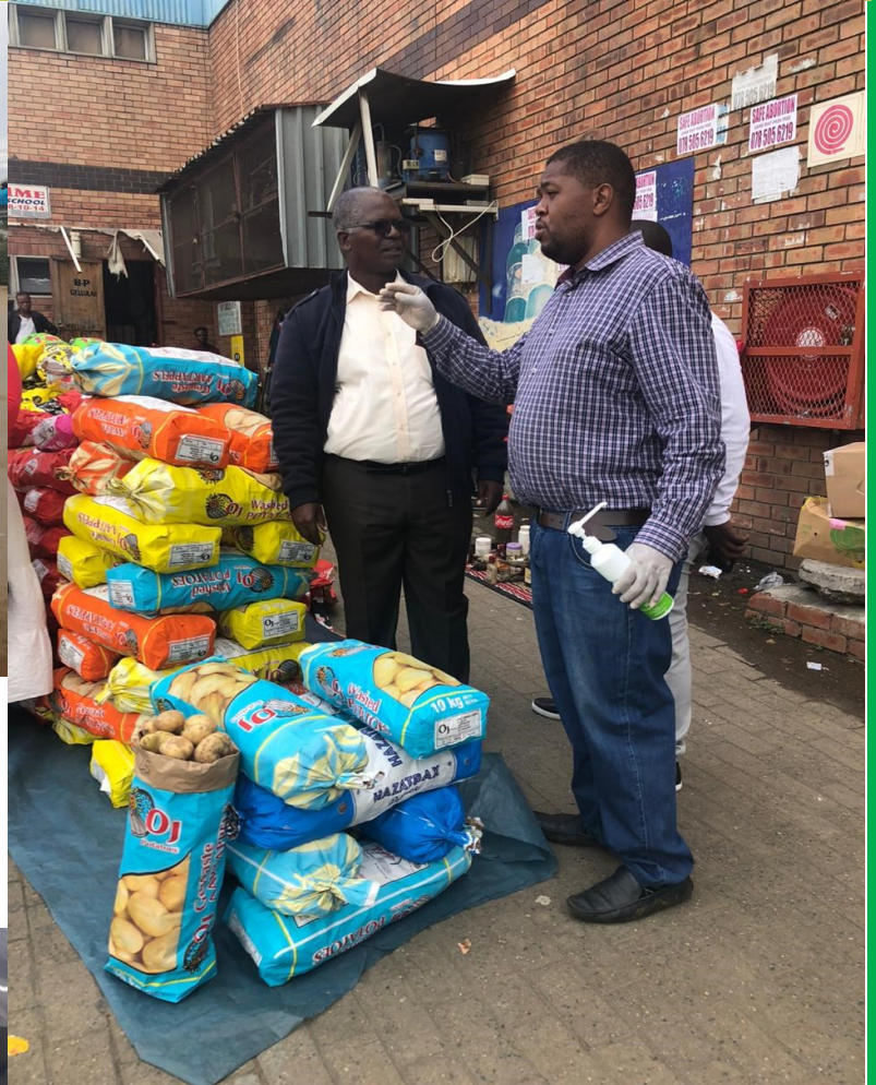
Mandeni: Cllr Mdlalose Municipal Mayor doing COVID -19 awareness at Mandini shopping centre