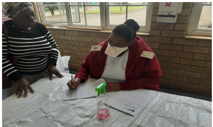
Ndwedwe CHC screening desk