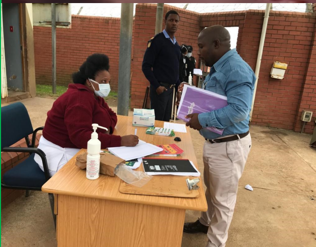
Montebello COVID-19 screening & Testing

Doctors have noticed symptomatic patterns among some COVID-19 patients which includes loss of smell and taste, though more research need to be carried out in this area to conclude whether either is a common sign of the virus. Vomiting and diarrhea are also a possible symptoms in "rare" cases of mild coronavirus; according to WHO.