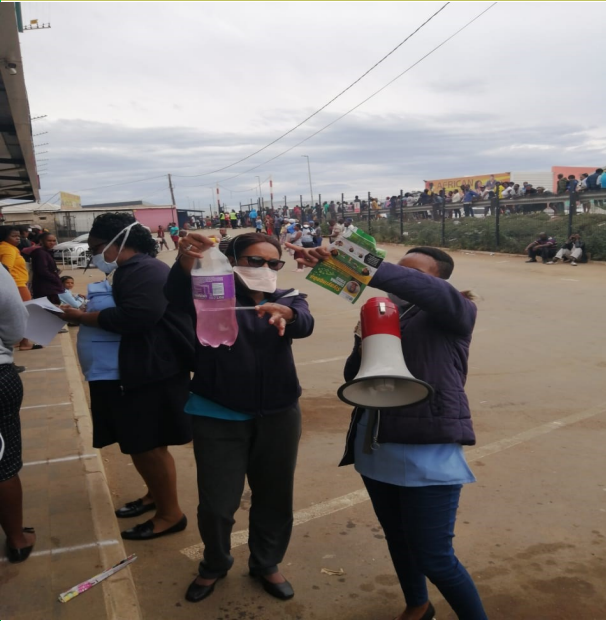
Montebello Team: tippy tap demonstration by nurses at Bhamshela Taxi rank