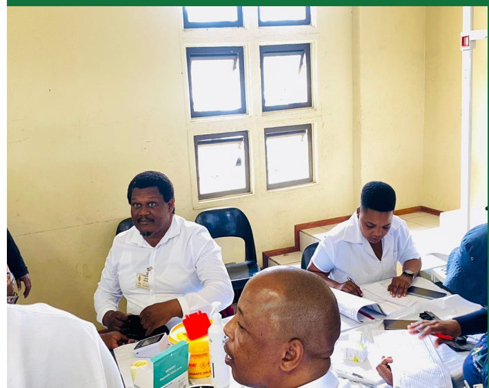
Health professionals in action