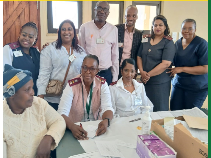
Kwadukuza Sub district Management team

A team of dentists set up in a mobile clinic, offering dental care that was previously out of reach for many. From simple dental check-ups to extractions and fillings, community members left with brighter smiles and improved oral health. Conti...next page