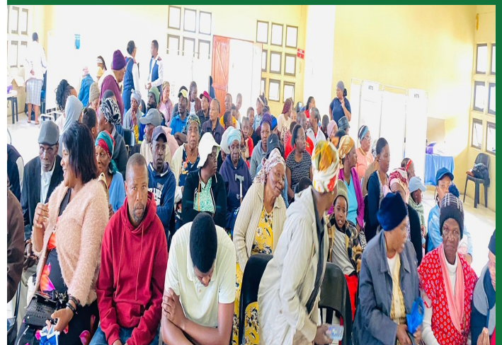
Patients waiting for services