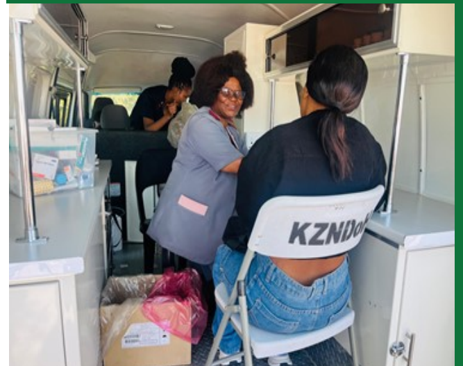
Health services provided