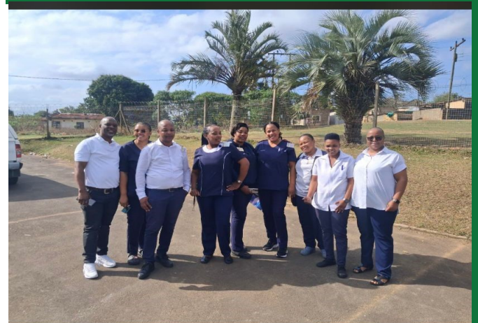
Community Outreach team