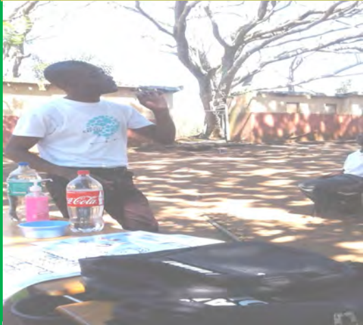
PHOTO GALLERY HAND WASHING MARATHON