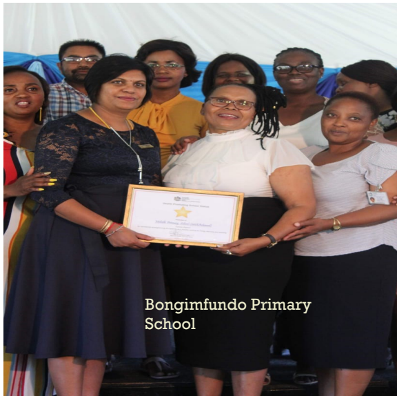
Bongimfundo Primary School

UMphumulo Hospital working together with Mbekaphansi School Health team launched Ocheni Primary School on 21 November 2019.