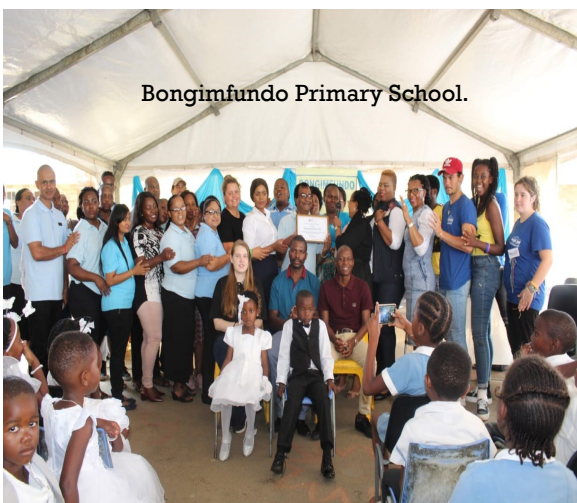
Bongimfundo Primary School.

L embe Health District managed to launch 6 schools as Health Promoting Schools and one crèche as Health Promoting ECD Centre up to the 3rd quarter of 2019. The following Sub Districts managed to launch schools that were assessed, KwaDukuza, Ndwedwe and Maphumulo. The Provincial assessment tool was used to determine the status of the school in health promotion. In summary, the following criteria was used: