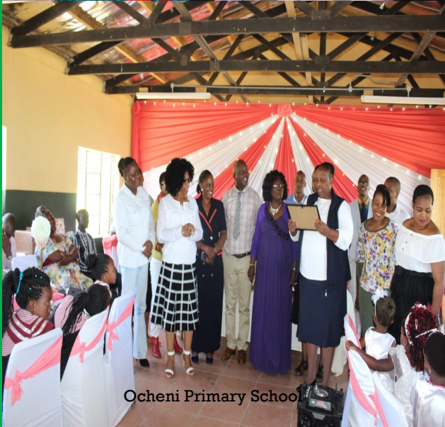
Ocheni Primary School