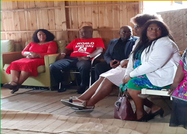
MEC leading delegation to Mavela Hospice at Ndwedwe