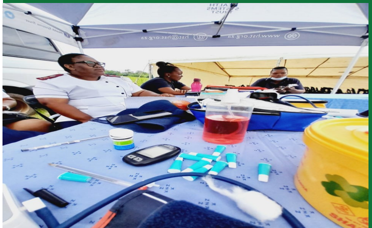
Health Services station