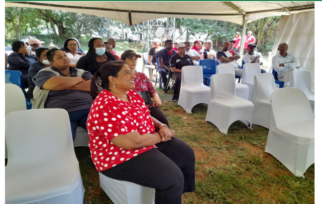
Staff listening to motivation