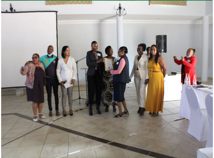
Maphumulo Hospital receiving certificate