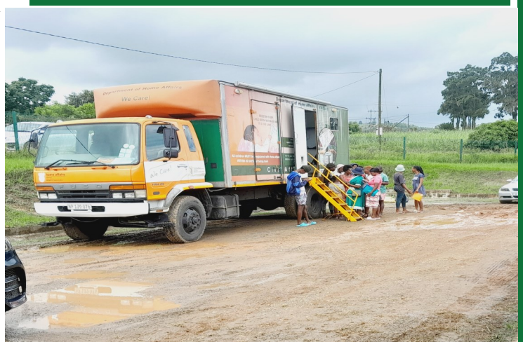
Home Affairs rendering services