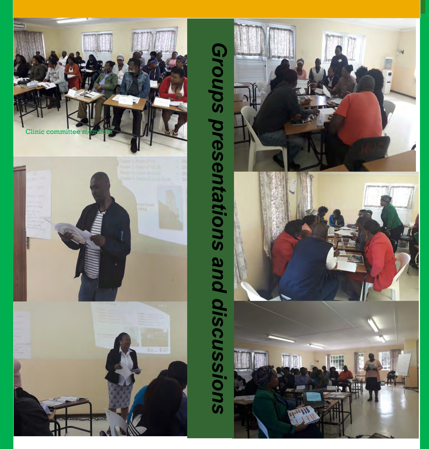
Well done Mandini Sub district team for the great start !!!