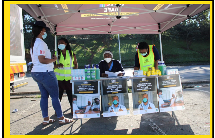
Display during vaccines promotion