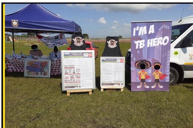
Tuberculosis messages displayed during the event