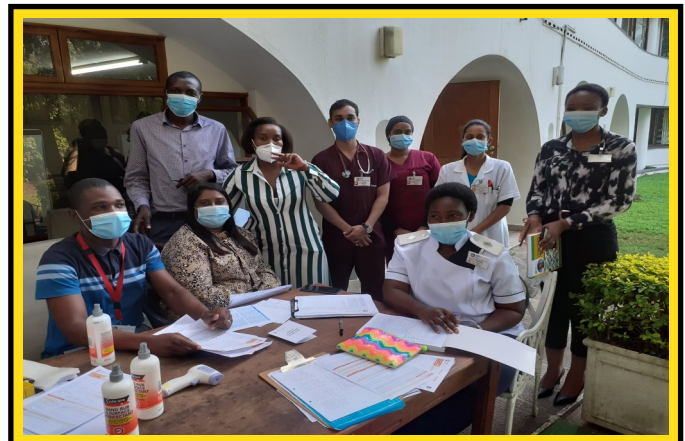
Kwadukuza PHC team during vaccination