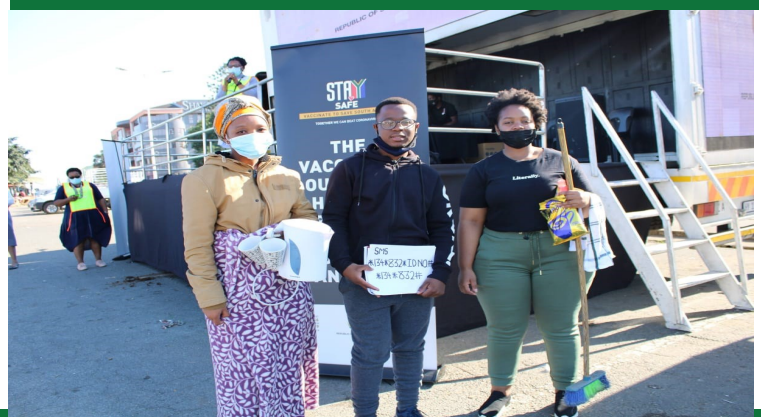
Covid-19 vaccines drama performance