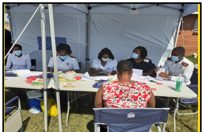
Health screening corner during the world TB day