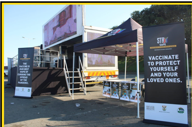
Setup during Covid-19 vaccination promotion day