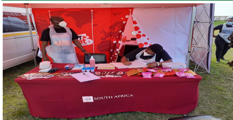
AHF South Africa providing services including distribution of material