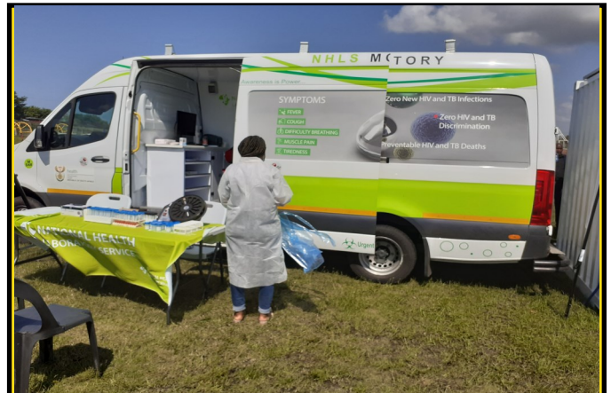
National Health Laboratory display during the Provincial World TB day