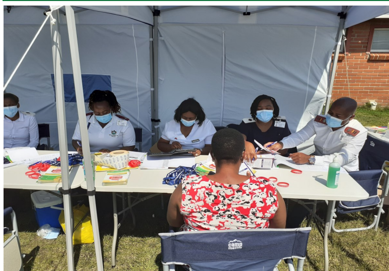
Health care workers providing health care services