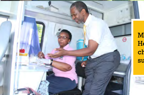
MEC for Health checking sugar levels