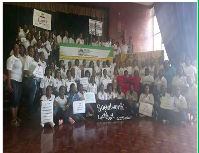
World Social Work Day

Social workers are an integral part of the multidisciplinary team and discharge planning. They make valuable recommendations relating to social aspects of patient care and social issues that affect treatment and compliance. Social workers are based at all levels of the healthcare continuum from primary health clinics to tertiary hospitals including specialized hospitals. Submitted by Zama Maxhakane.