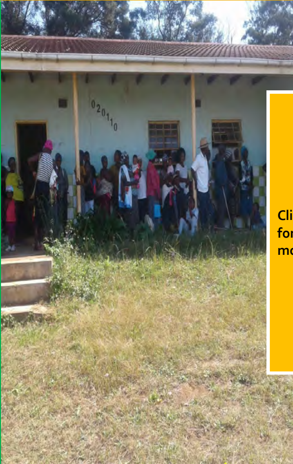
Clients waiting for service at a mobile point