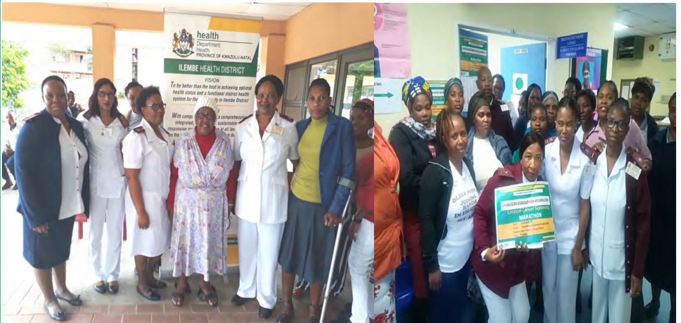
Above is KwaDukuza clinic team with clients completed papsmears

Ilembe health district conducted its cervical cancer marathon on 18 May 2018 with the aim of reaching out to women of 30 years and above for papsmears. Ilembe had to perform 400 pep smears and each sub district had to do their own campaign. Maphumulo sub-district performed 59 papsmears at Maphumulo Clinic. KwaDukuza sub-district did the 76 papsmears, and Ndwedwe sub-district performed 130. The total number of 265 papsmears were done. The teams did not do only papsmears but they also treated sexual transmitted diseases and inserted sub dermal implants and intra uterine contraceptive devices (IUCDs). The campaign was a great Success.