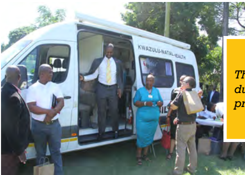
The MEC during projects visit