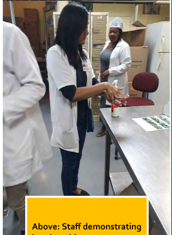
Above: Staff demonstrating hand washing