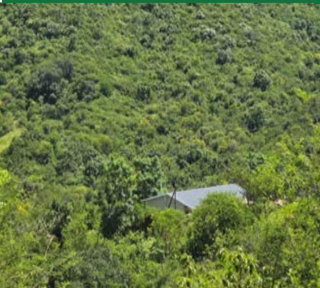
Ezithabeni Secondary School