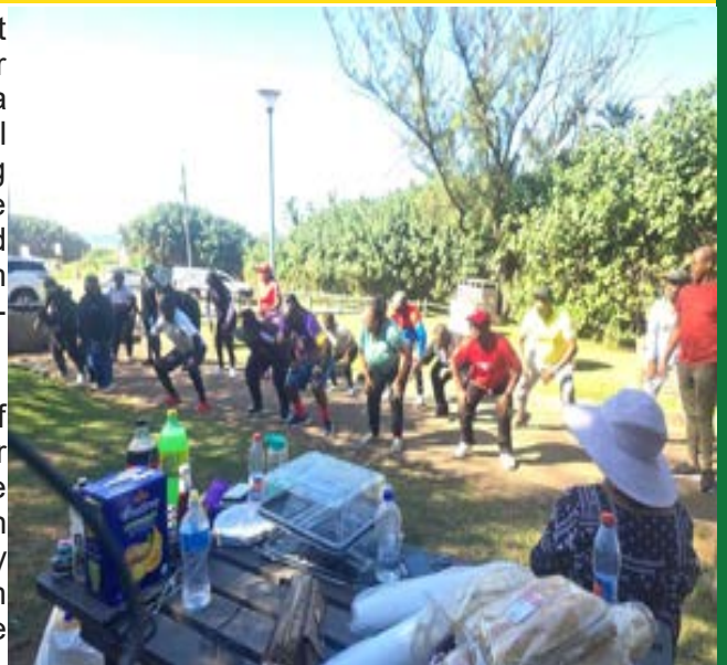
Ilembe District Office team doing aerobics

In conclusion, the first Healthy Lifestyle Walk of 2025 was more than just an event; it was a celebration of wellness, teamwork, and community spirit. The Ilembe District Office's dedication to promoting health and unity is commendable, and such initiatives should inspire all to commit to a lifestyle that values health and togetherness. As we look ahead, let us all embrace these opportunities to walk together, grow stronger, and create a healthier future for ourselves.