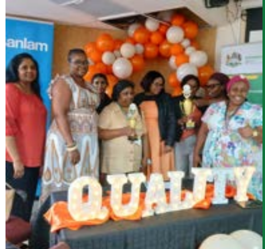
Umphumulo Hospital team with their awards

This event served as a powerful reminder of the collective effort, dedication, and passion of individuals and teams in the ILembe District's health establishments. Their achievements are a testament to the ongoing commitment to providing quality healthcare to the people of ILembe. The recognition and celebration of their efforts inspire further excellence in the pursuit of a healthier community.