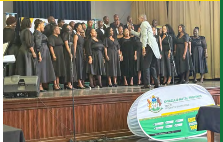
Ilembe district choir