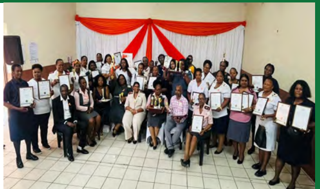
Kwadukuza PHC Team