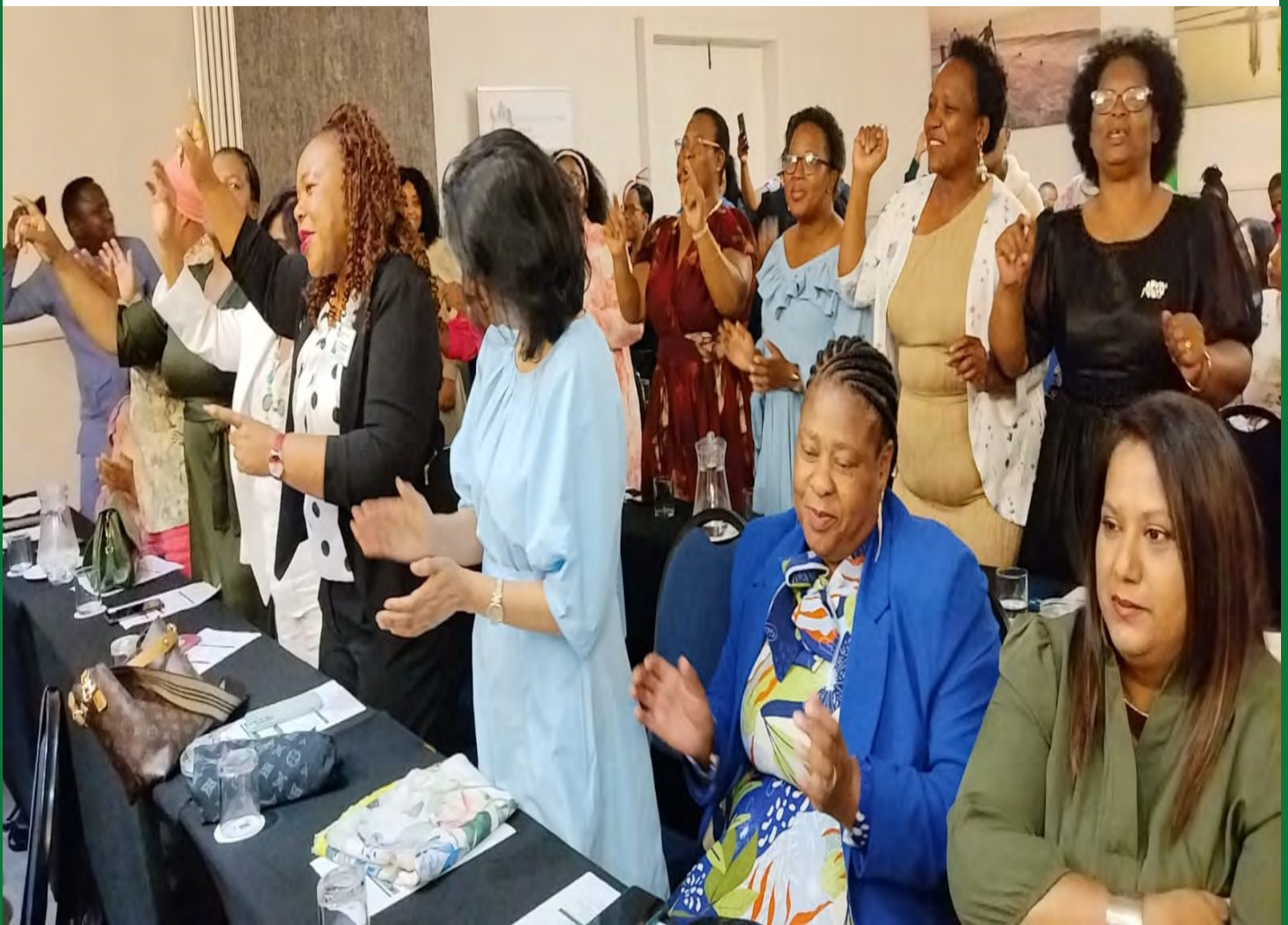
Region 1 team (Ilembe and Ethekwini Districts)