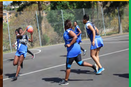
Ilembe District Wellness Day