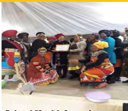
School Health Launch

Traditional Health Practitioners and Healers during the event, read more on page 2