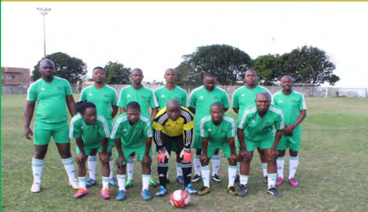
Sundumbili CHC soccer team