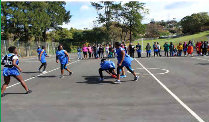
Umpfumulo & Stanger Hospital teams in action