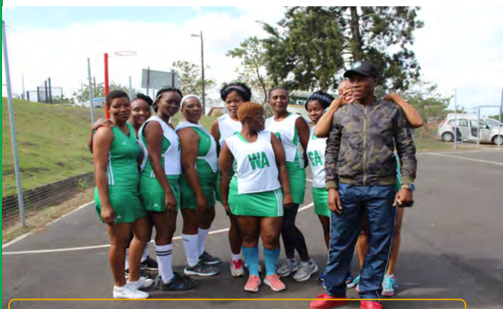
Sundumbili CHC netball team