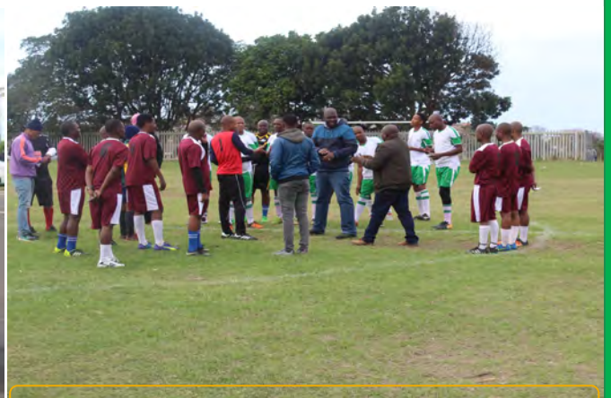
ILEmbe District & Untunjambili Hospital