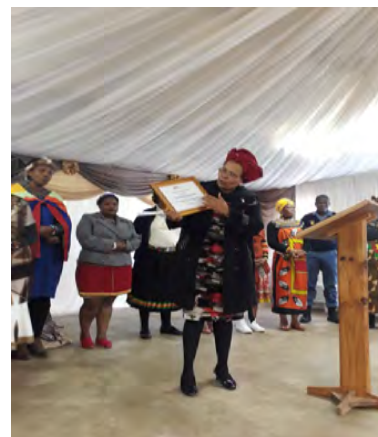
Promotion reading the certificate