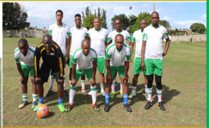
Untunjambili Hospital soccer team