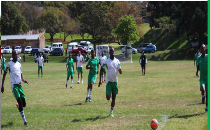
Sundumbili & Untunjambili Hospital teams in action