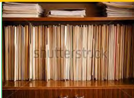
Meet records committee