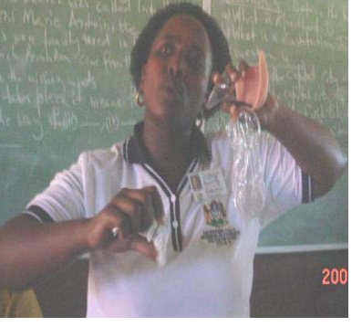
Miss L.Maphalalademonstrating female condom