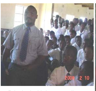
Principal with Learners listening to the presentation