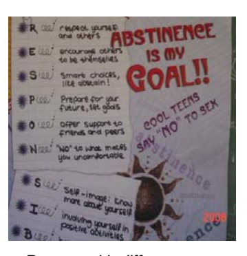
Posters with different messages