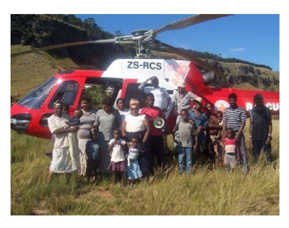
Happy community members who benefited from the campaign