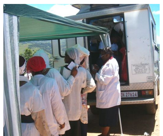
Mobile Services in the Holy Mountain