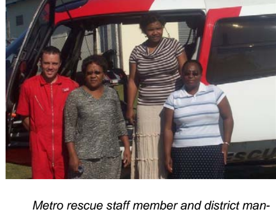
Metro rescue staff member and district management team