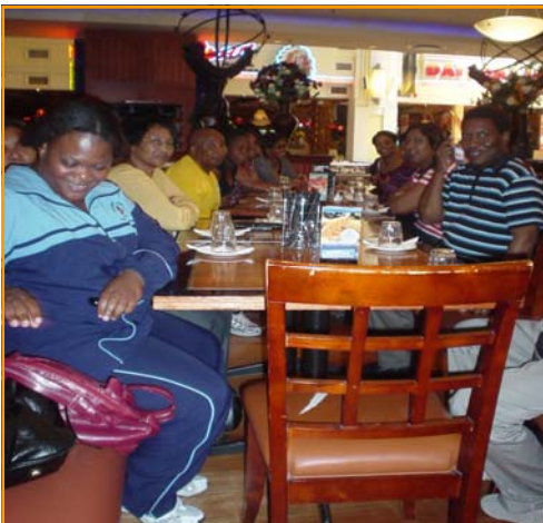
Team before lunch time