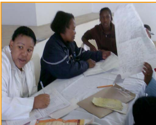
District Staff Members during the campaign

S hembe Health District held immunisation catch up campaign on 25 October 2008 at Shayamoya Area in Stanger.