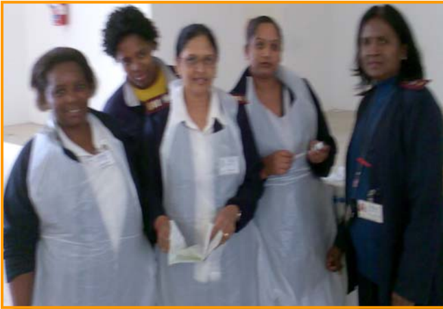
Team during Immunisation Campaign