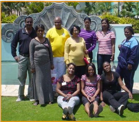
P, M & E TEAM

The Ilembe Health District Planning, Monitoring and Evaluation team held its own team building on 31 October 2008 at Durban Suncoast.