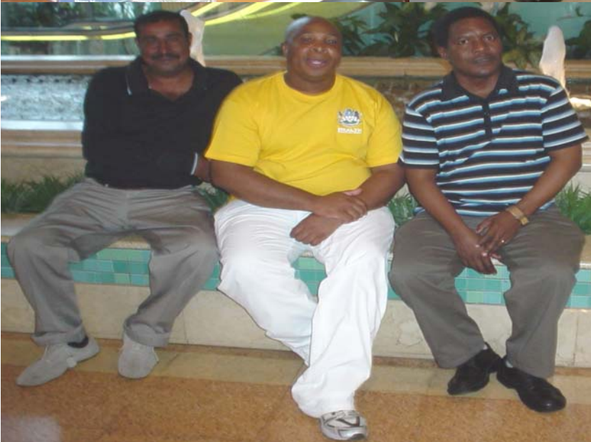
Planning , Monitoring and Evaluation staff members during their team building.