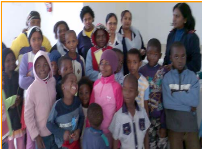
Team with Parents and kids during the campaign