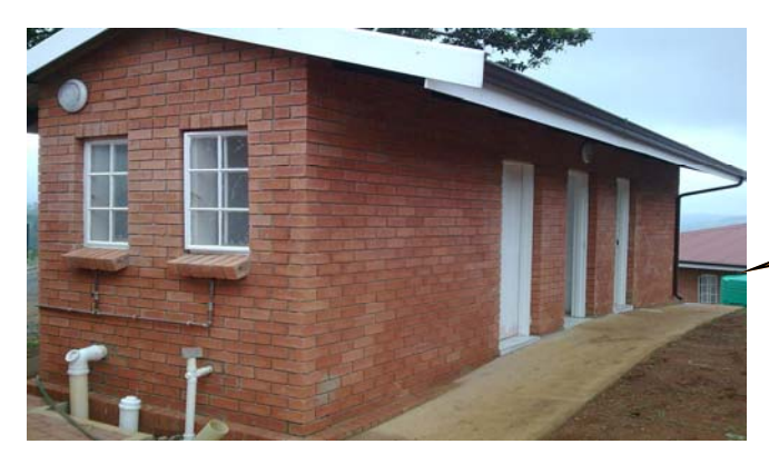
New Public Toilets at KwaNyuswa Clinic

Mmm! Lendlu yokuzikhulula ungalala ngisho kuyo indlela enhle ngayo!