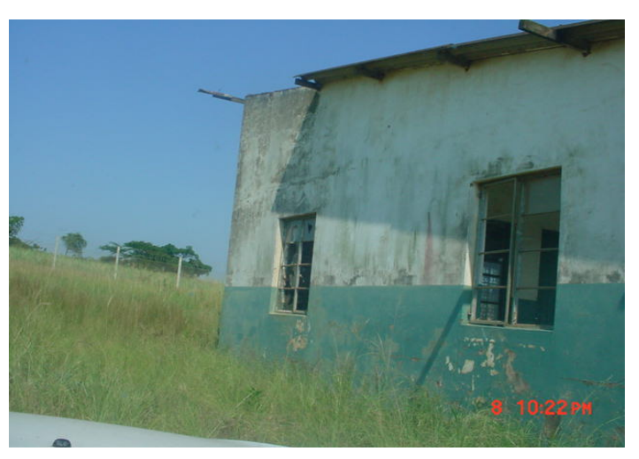
Nsunduzane Health post before renovations