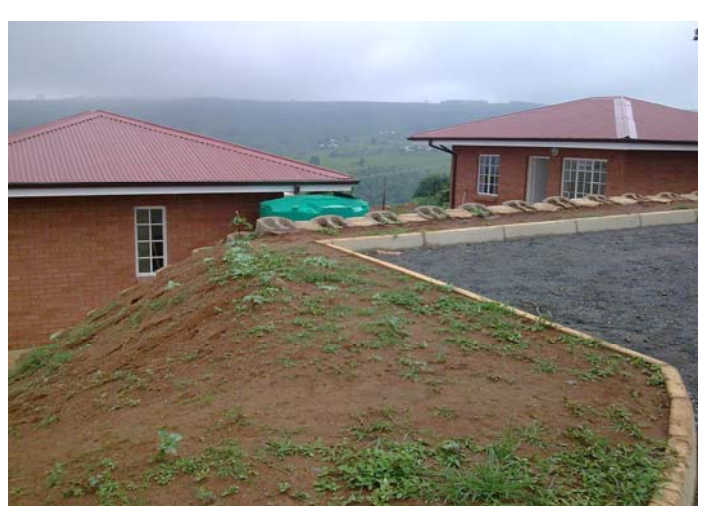
KwaNyuswa Clinic, residence and paving