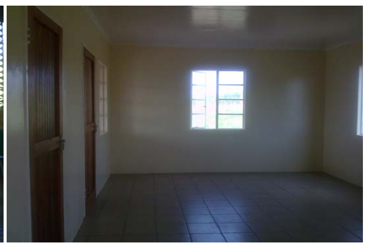
Inside walls after