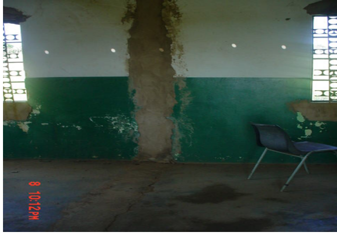
Inside walls before