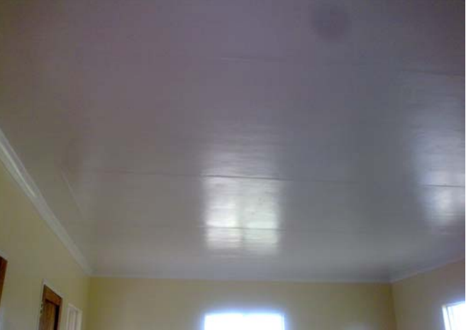
Inside Nsunduzane Clinic after renovations