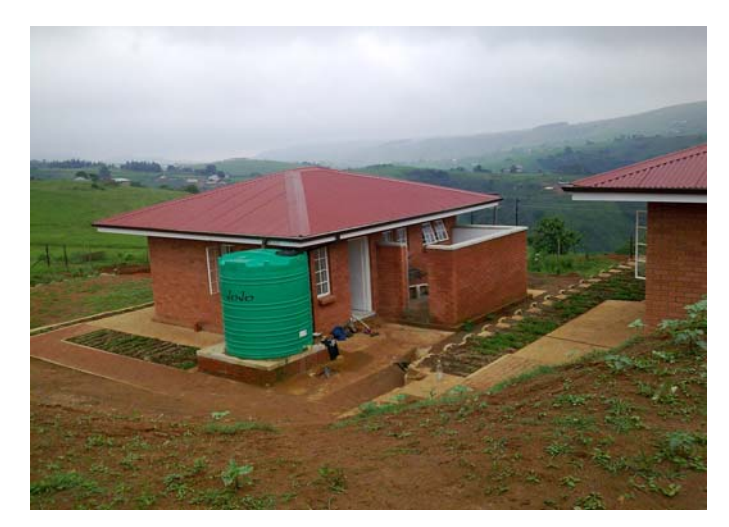
The new nurses' residence for kwaNyuswa clinic