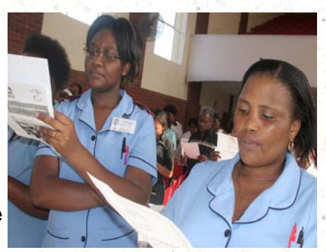
Health Professionals pledging to volunteer their services to the communities of llembe District

The programme for 2009 has been drawn out for Khanya Africa activities. The District is one of the few that submitted their programmes early and was awarded with a laptop.