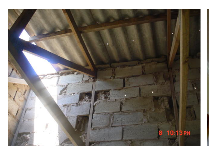
Inside Nsunduzane Clinic before renovations