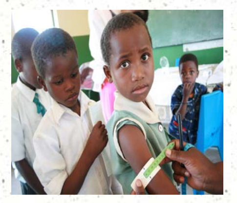
Mid Upper Arm Circumference