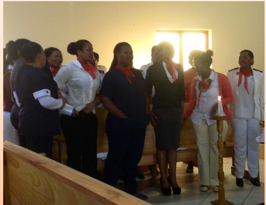
ICHC Choir blessed the occasion with a sweet melody

Senior Nursing on their beautiful white apparel