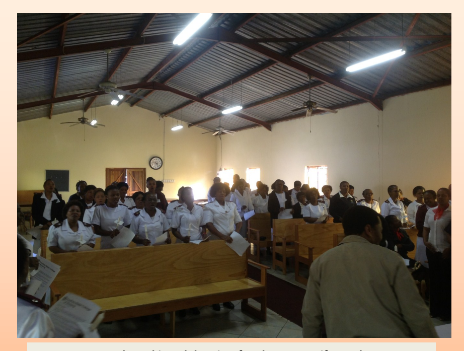
As we gathered in celebration for the new uniform change