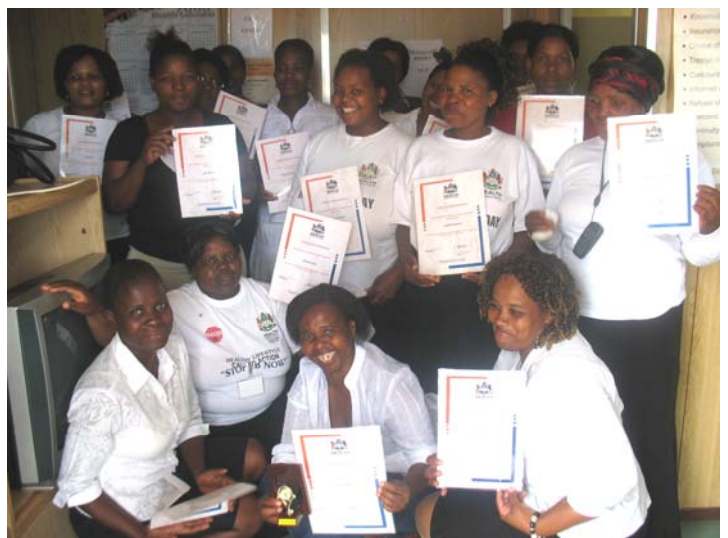
Home Based Carers babethokoze ngempela ngokwamukeliswa izitifiketi zabo ngomsebenzi omkhulu abawenzayo besebenza ngokubambisana nesibhedlela.