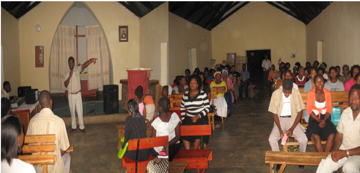
Itshelejuba hospital staff and HCF friends attending an evening service at the hospital Chapel.