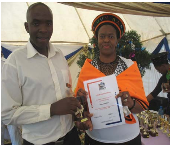
Umfo kaMagwaza lona ophethe umtholampilo waseQalukubheka, naye bandla uthi kwamjabulisa ukuthi isikhungo sakhe si sibambe iqhaza ekulweni nezifo