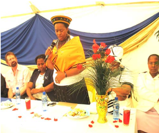
Above: The Chief Executive Officer delivering a speech at the ceremony

The traditional attire was preferred as a dress code for the day to signify our roots and to show our beautiful cultures and beliefs.