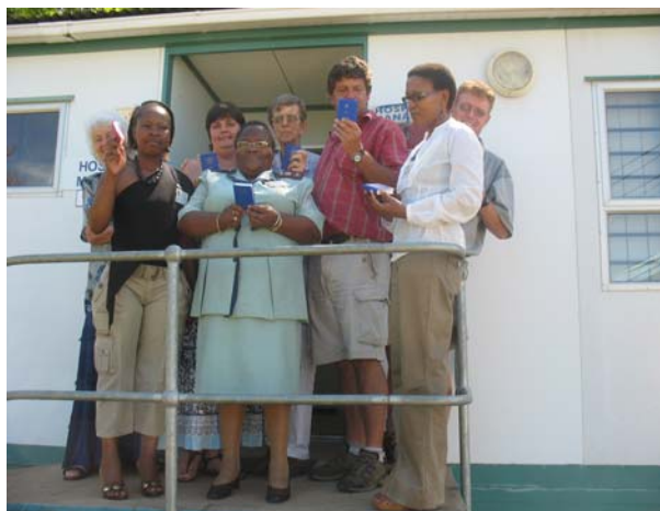
Team from Gideons with hospital Management before starting their ward visits.

Free bibles were given to staff and patients as a symbol of love from God.