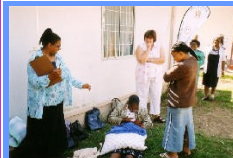
The home base career demonstrate how to breastfed

The National Breastfeeding Team visited this hospital on October 2005 to evaluate whether this hospital is compliant to Breastfeeding before accredited as a Baby friendly hospital, the hospital Care Givers avail themselves to sing , play drama and to demonstrate how to bread feed. The hospital Management would like to thank the hospital Breast Feeding Team for training all hospital staff about the breast feeding.