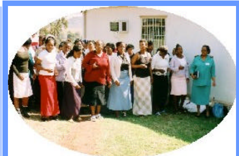
kungesikhathi wona belu ama Care Givers ecula ingoma yokuncelisa