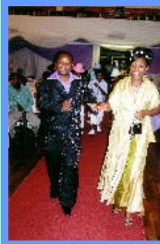
Kungesikhathi umakoti nomkhwenyana beshaya kancane ngonyawo lonwabu, behamba ku Red Carpet bengena e