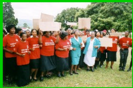
Home base carers marching against Women