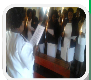
NURSES DAY OF PRAYER READ MORE PAGE 6-7