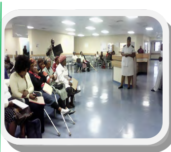
MALARIA DAY READ MORE ON PAGE 4