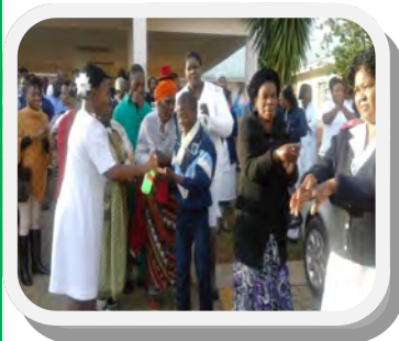
HAND HYGIENE DAY READ MORE ON PAGE 3