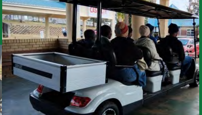
Patients were so happy to be transported by their vehicle.