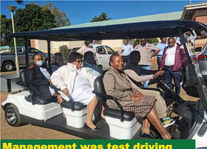
Management was test driving the Vehicle.