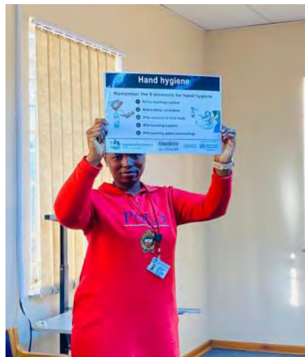
NS Moloi (HRDP)