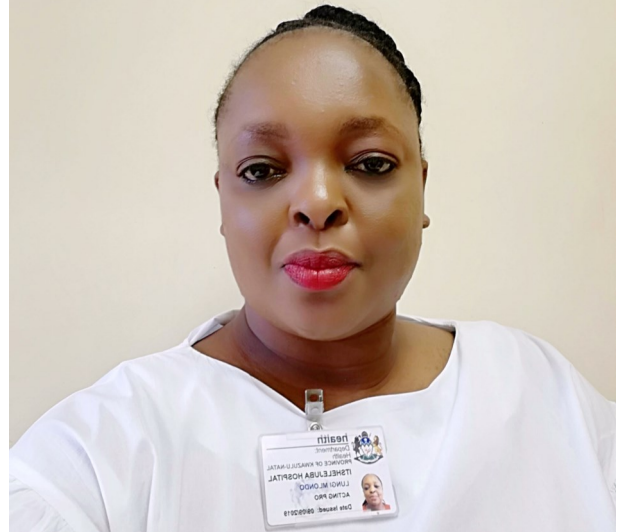
MISS N.O MLONDO ACTING PRO WRITER & PHOTOGRAPHER