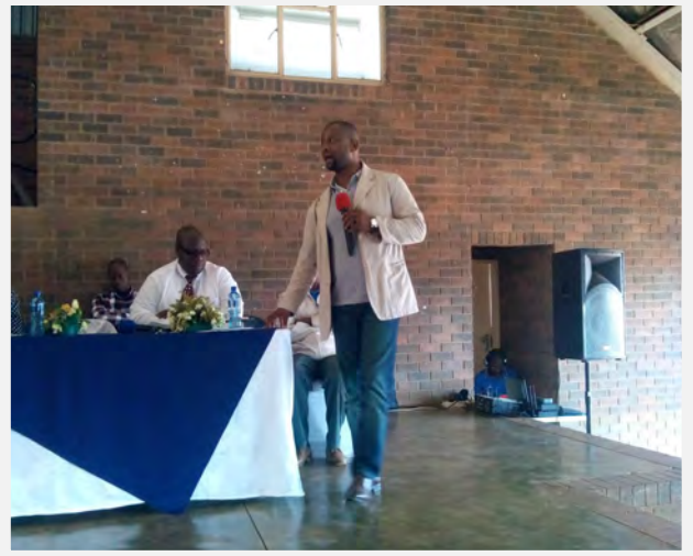
The Prince Nhlanganiso Zulu addressing the community.