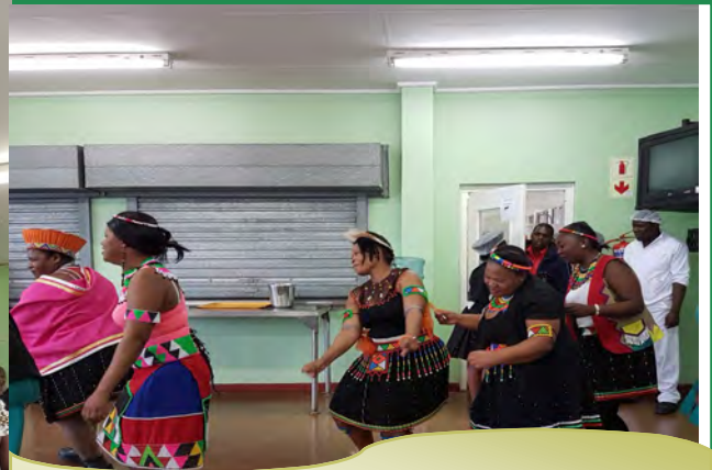
Izimbungulu singing their traditional songs celebrating heritage day.