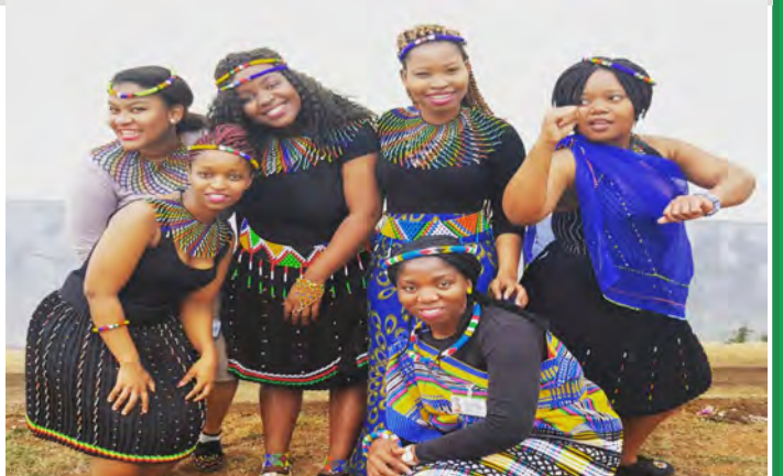
Such a wonderful day beliefs, values, customs, dress code, personal decoration all of these means we are one.