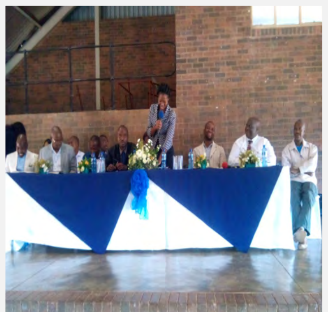
The mayor of uPhongolo Municipality was emphasising the importance of being circumcised.

On the 15 th of September Itshelejuba Hospital was visited by Prince Nhlanganiso Zulu at Belgrade Community Hall. The purpose of the day was to address the community on strategic health programmes including MMC.