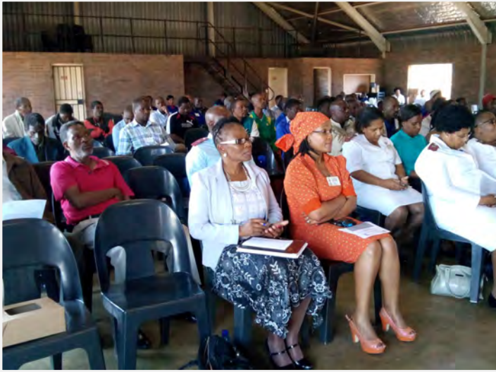
Management team together with Belgrade community.