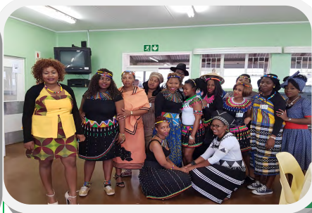
HERITAGE DAY READ MORE ON PAGE 3