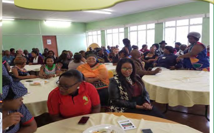
Zaziconsa ngalolu hlobo izintokazi zibungaza lolusuku lwamagugu.