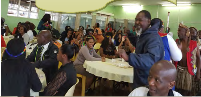
Staff members for Itshelejuba hospital together with our visitors from old mutual.