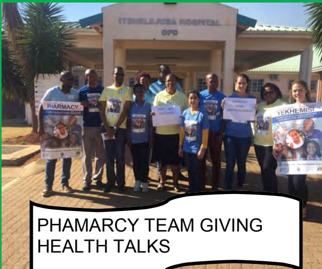
PHAMARCY TEAM GIVING HEALTH TALKS