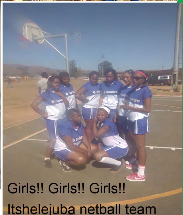
Girls!! Girls!! Girls!! Itshelejuba netball team