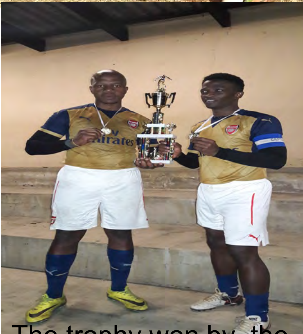
The trophy won by the soccer team. Halala!!!