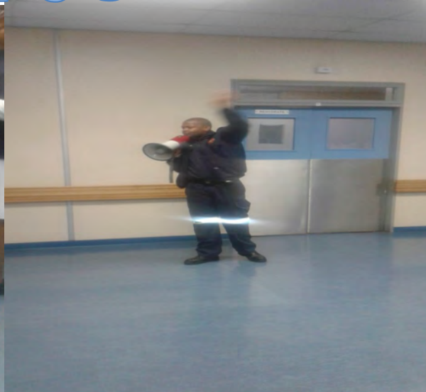
The UPhongola municipality fire department assisted on the drill