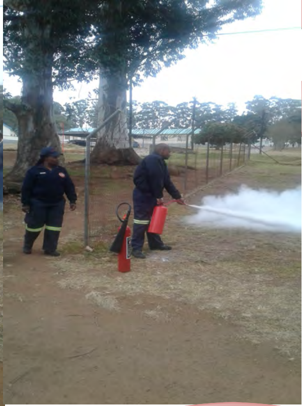
Demonstration on how to use a fire extinguisher during emergency cases.