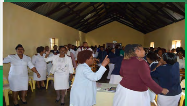
Nursing Staff singing and dancing on their day.

On the 24 th of May 2017 Itshelejuba Hospital had a nurses day of prayer at the Hospital Chapel. The purpose of the day was to encourage and motivate the nurses on the good work they are doing to care and nurture the sick and to thank God for assigning them to do such a task.