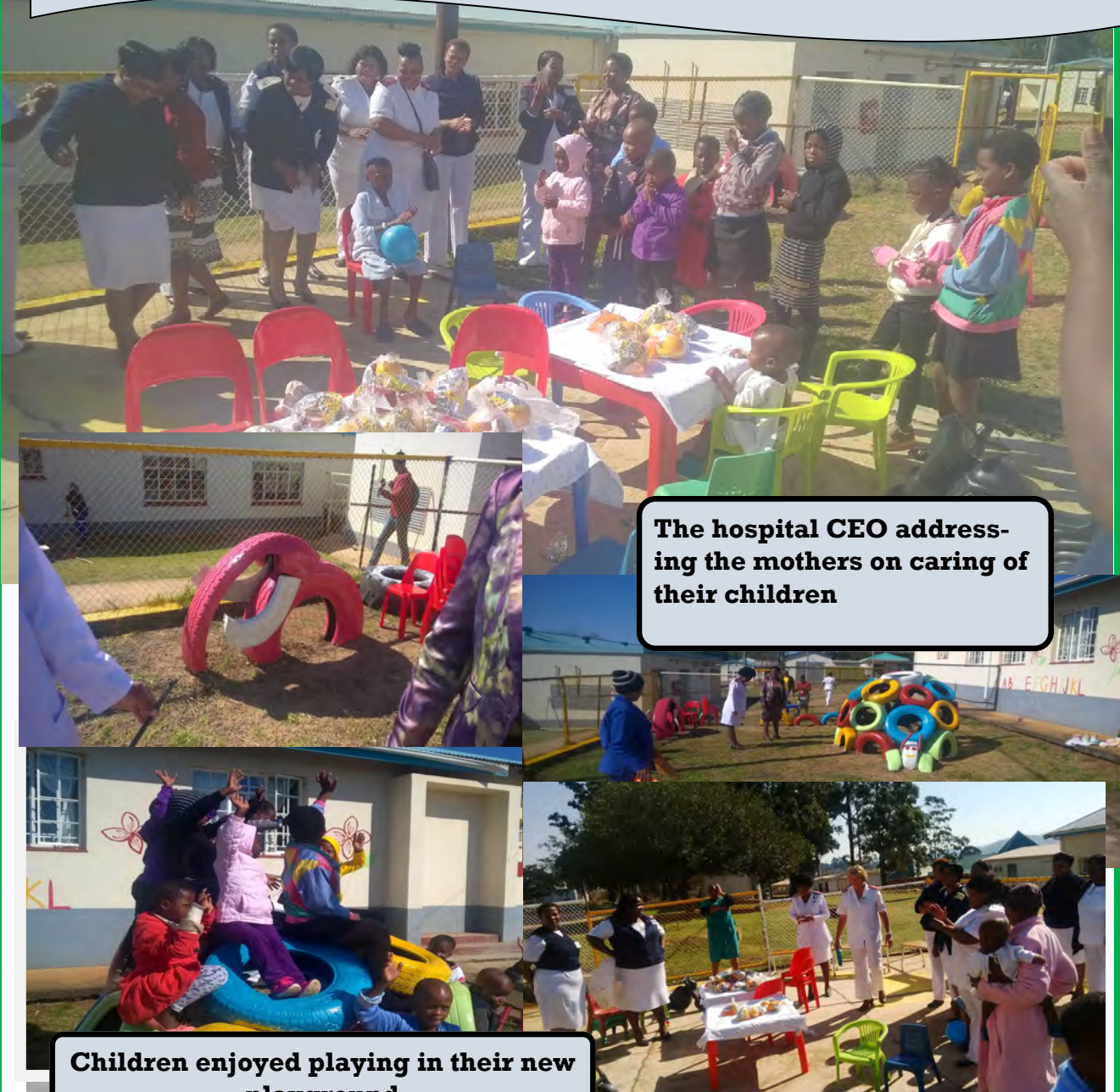
The hospital CEO addressing the mothers on caring of their children