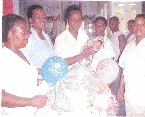
Staff in the Labour & Nursery wards came together to celebrate the birth of the Christmas Baby.

No major hiccups were reported in the hospital this past festive season despite the influx of visitors to Durban.