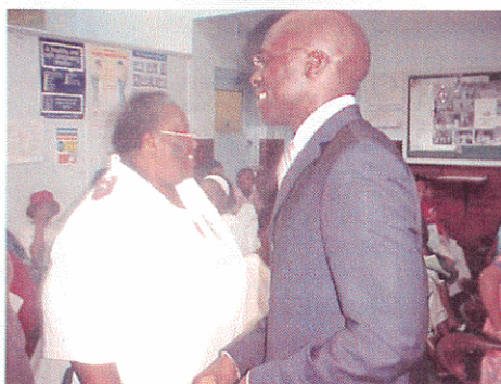
Deputy Minister of Home Affairs Mr Malusi Gigaba in the Antenatal Clinic during the launch of On-Line Birth registration Office.