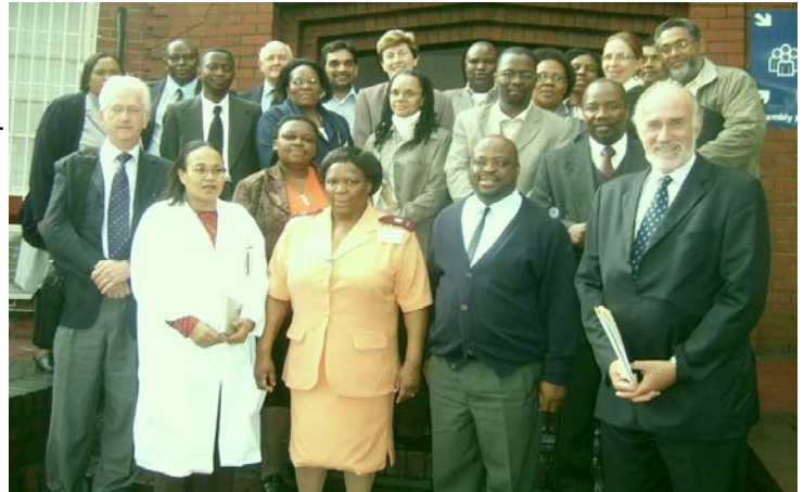
Management team and Members of Health Profession Council