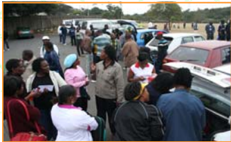
Mini Tournaments at Cato Manor Grounds