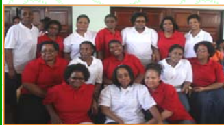
Nursing College News Pg 3