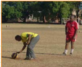
Mzayoni getting ready to take a penalty kick