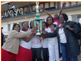
Some Netball team members