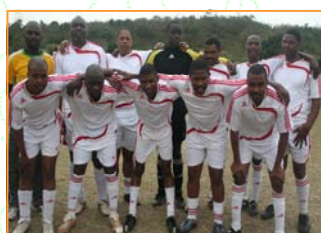
KE8H Soccer Team