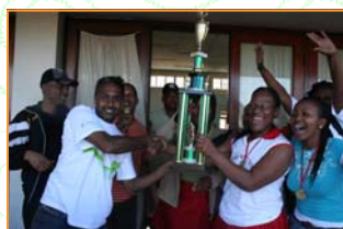
Mr.. From Spoortnet handing over the trophy to our netball