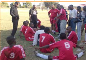
KE8H Soccer players during half-time