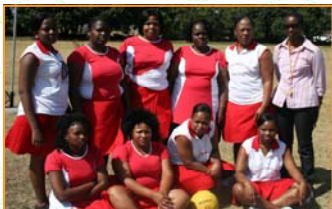
KE8H Netball Team

King Edward VIII Hospital was part of Mini Tournament Games between eight institutions. Among these institutions were Murchison, Port Shepstone, R.K