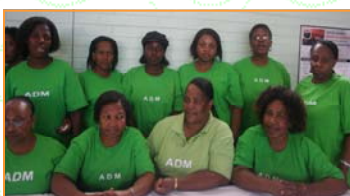
ADVANCE MIDWIFES GROUP

The 08th August was a big day for the Nursing College at KE8H; when they said farewell to group 09/2007. Learner Representative Council always take the initiative of welcoming new group and saying farewell to the outgoing one.