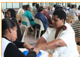
More on women's day celebration