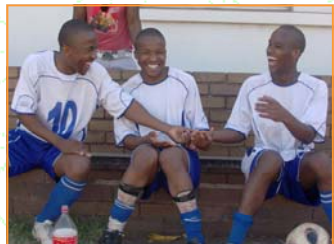
Transnet soccer team members