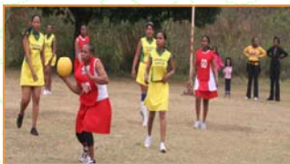
KE8H ladies VS Umphumulo Hos.