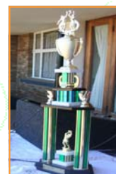
Netball Trophy won by KE8H

Although our guys didn't win, the ladies represented by coming home with gold medals and the trophy. Well done ladies and the guys because the fact that you represented KE8H is a win on its own!