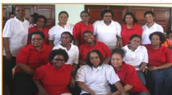
ICU / CRITICAL CARE GROUP

"There are two kinds of people, those who do the work and those who take credit. Try to be in the first group; there is less competition there."