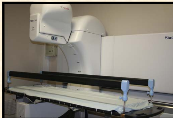
Top: Lodox machine for x-raying whole body. Left: Trauma Unit before renovations and after renovations on the right

contractors, for ensuring that the deadline of five weeks is met.