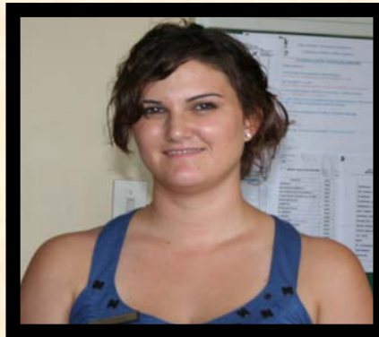
Miss Chani: Dempsey Comm. Serve Occupational Therapist

The most common assessments, without treatment, being done by the department are functional assessments which are attached to the doc-