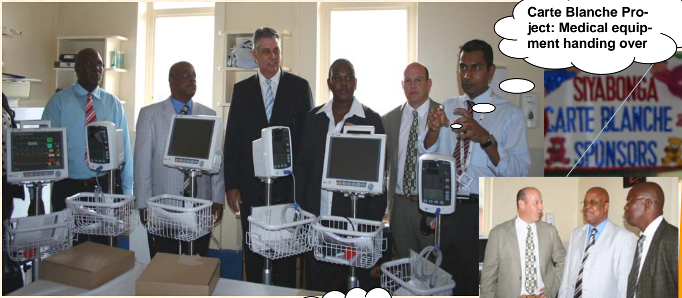
Carte Blanche Project: Medical equipment handing over