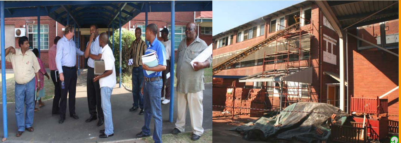
Above: Local and Provincial Team doing a walk about with the contractor before the renovations started. Left: I Block renovations on progress while below N Block roof is erected.

We are urging all stakeholders (patients, relatives, staff members and the community) to be patient with us while we are doing this work. It should also be noted that while renovations are taking place, we continue providing service to patients as wards below these ones are functioning.