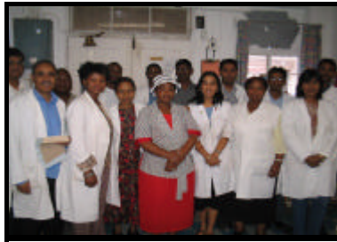
Pharmacy staff members

? Family planning clinics at King George V Hospital and Commercial City.