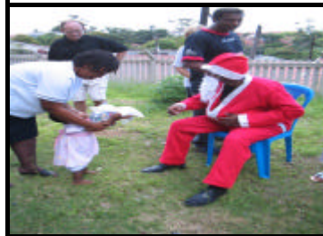
Santa clause handing out gifts.