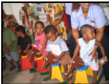
PEDIATRICS RECEIVING CHRISTMAS GIFTS.