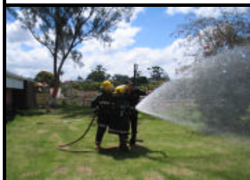
Kids enjoying water from the fire engine.