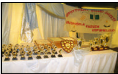
Trophies for the service excellence