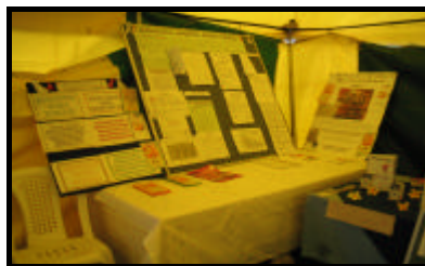
Quality Improvement Initiatives Displays