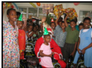
Kids with Santa clause