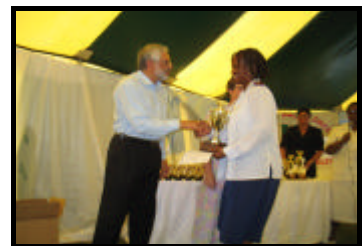
Hospital Manager presenting awards