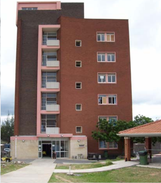
Multistory T.B. Wards