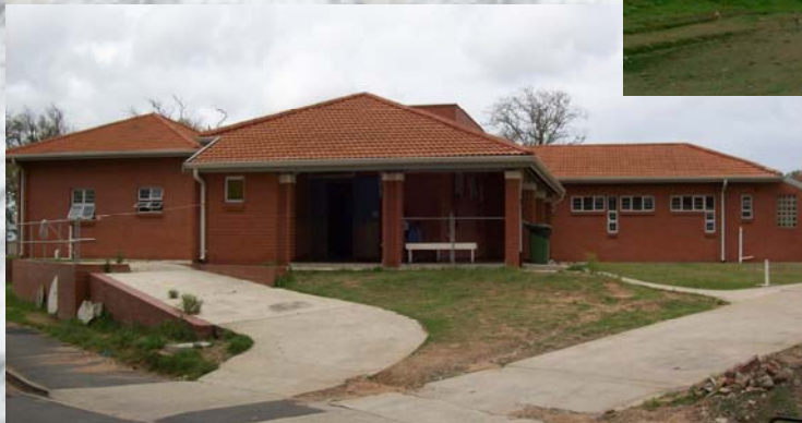
NEW STAR SHAPE MDR TB WARD