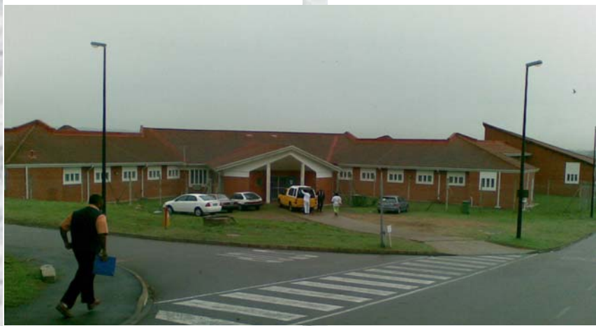
NEW CLOSE UNIT FOR PYSCHRICT UNIT WARD F & G

King George V hospital is currently under revitalization program and the anticipated date for completion is October 2009. new star shape wards have been built to accommodate the total number of 120 MDR TB patients administration office which include management will relocate to park home city because the old building will be demolished, new facilities will be erected.