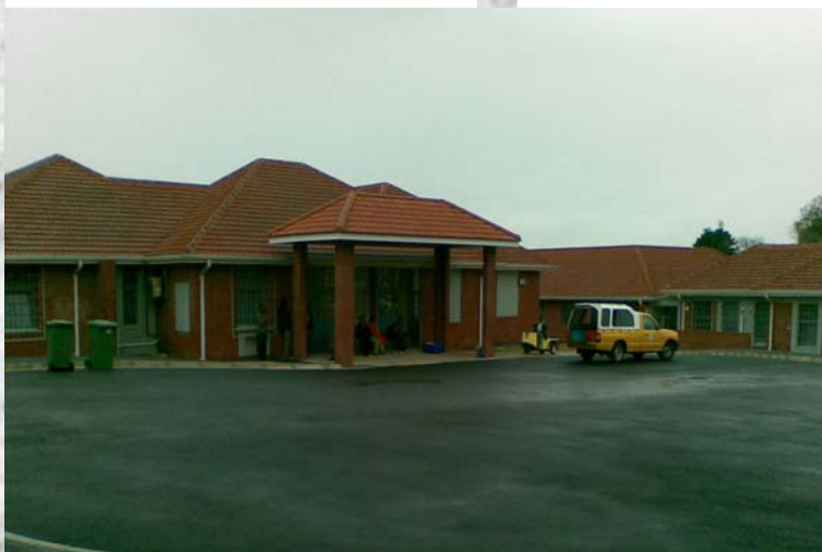
NEW PSCYHTRIC WARD AND OPD