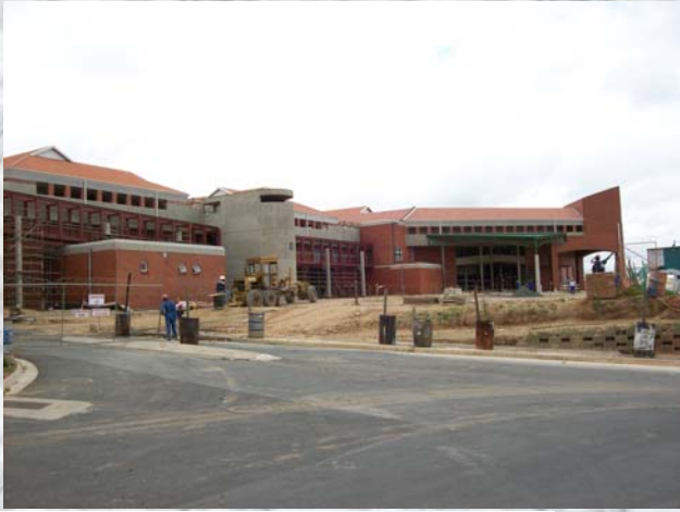
New level 1 District Hospital