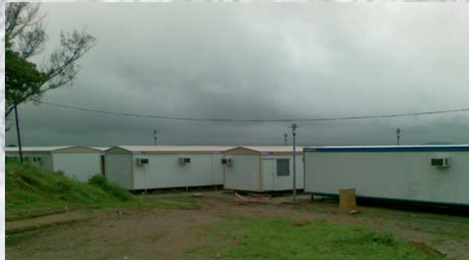
PARK HOME CITY FOR ADMIN