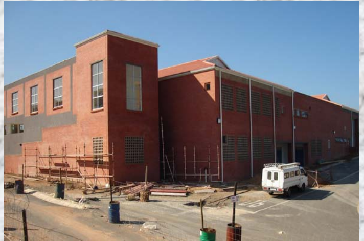
New Kitchen and Dining