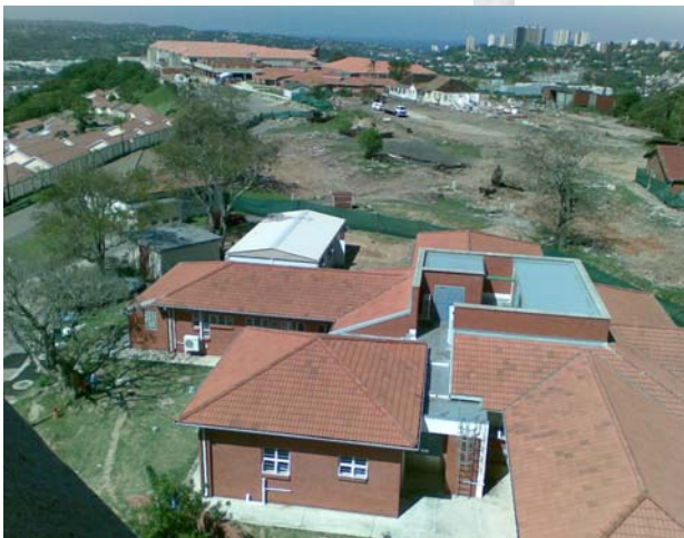
ARIAL PHOTO AFTER MDR FOLLOW UP CLINIC