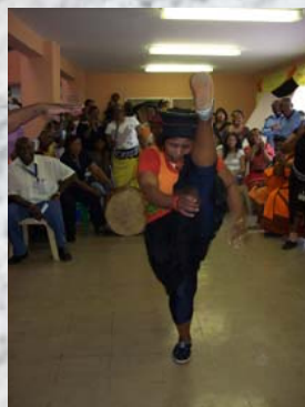
Yagiya intombi madoda Hhawu. Thobile umlenze phezulu