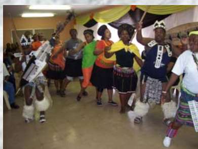
Wobhasobha uma sekufike insizwa