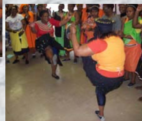
Senza njena uma sidlala