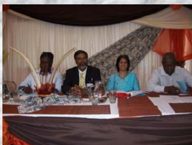
EXCO Members & Guests