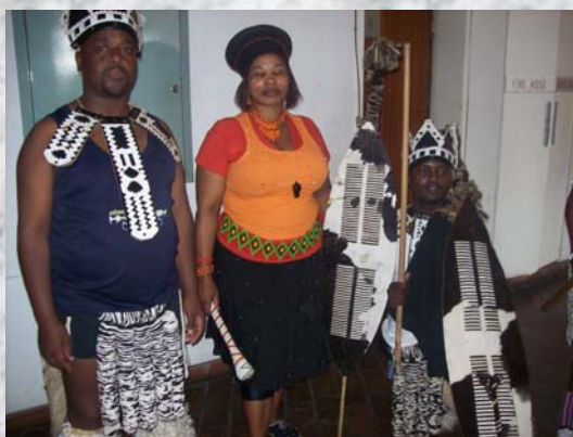
Inkiyankiya kumanzi phansi