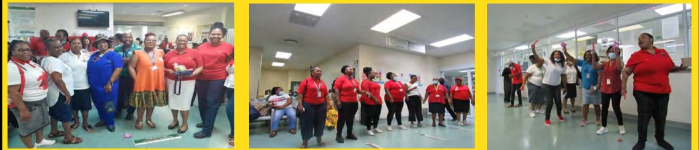
Drama by Khethimpilo team