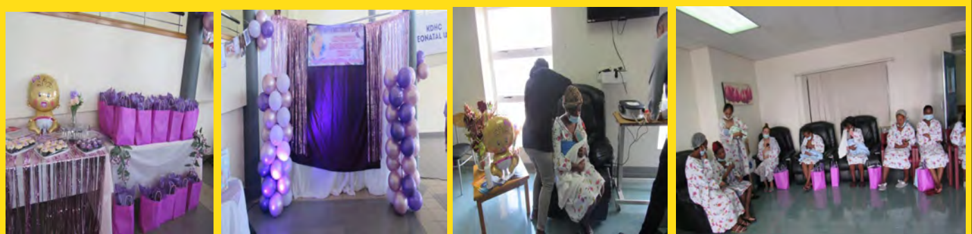
Q&A session to our patient and wonderful prizes giveaways