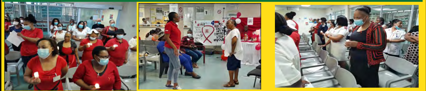
Hast team and guest.