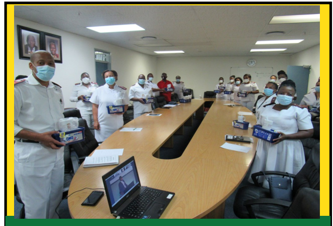
DENOSA Donated coffee mugs to all nurses at KDHC

Nurses day was commemorated different this year due to COVID 19, International Nurses' Day is celebrated annually on 12 May, the anniversary of the founder of modern day nursing, Florence Nightingale's birthday.