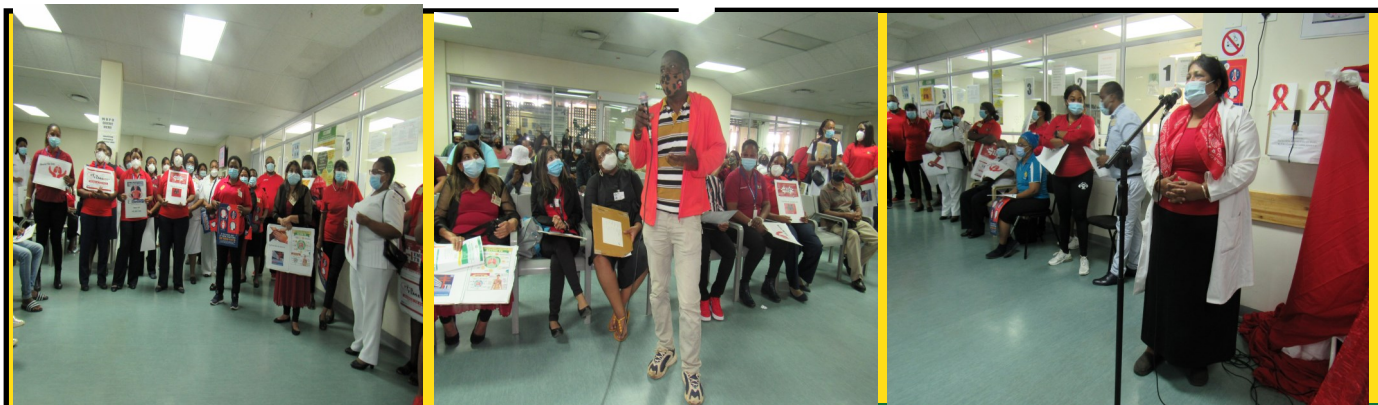
Testimony from the patients