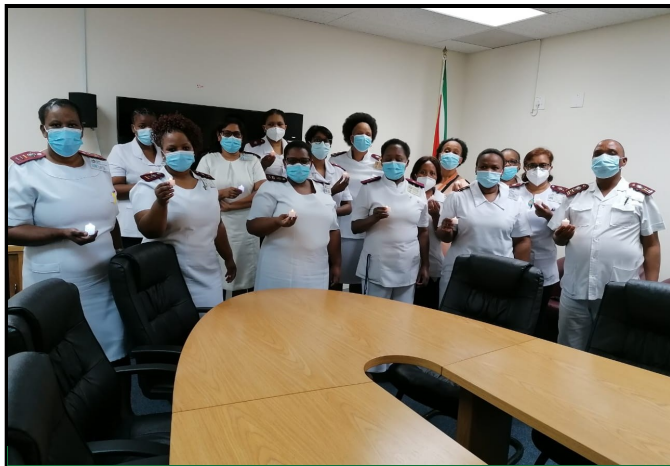
NURSES PLEDGE 2021