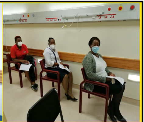
Holding area after receiving vaccine