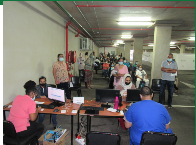
EVDS Registration of patients

Management will like to take this opportunity to apologies for this inconvenience and your sacrifice will benefit the patients greatly and in keeping with our motto namely, " Batho Pele " and in acknowledgement that we are here primarily for our patients and patients are our core business. Special thanks to those staff who voluntarily gave their undercover parking bays. Thank you again all