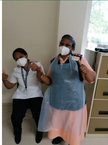
first dose of fizzer vaccine .