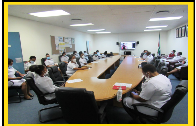
Nurses day virtual meeting