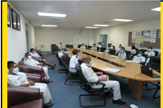
Nurses day virtual meeting