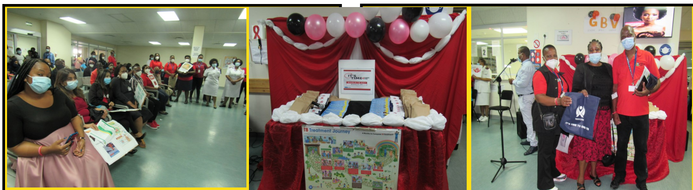
MOPD patients paying attentive attention to the speakers giving in-service education