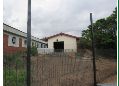
Before upgrades and after