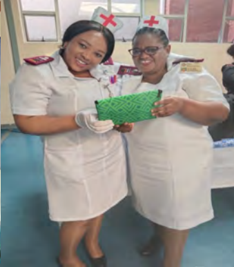
MESSAGE OF SUPPORT FROM ORGANISE LABOUR