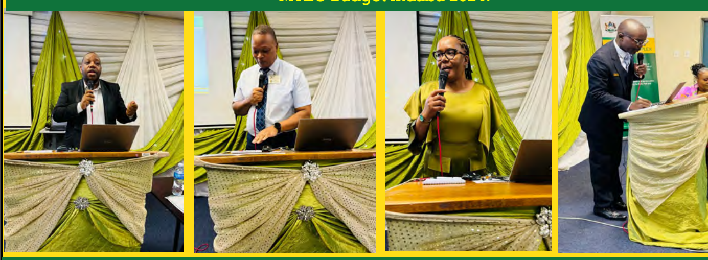
Speakers from provincial Office, District Office and KDHC EXCO Members .