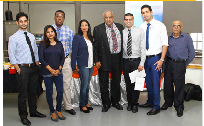
The spinal team 2016