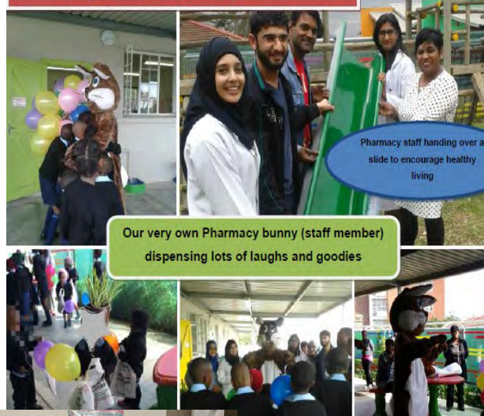
Pharmacy staff handing over a slide to encourage healthy living