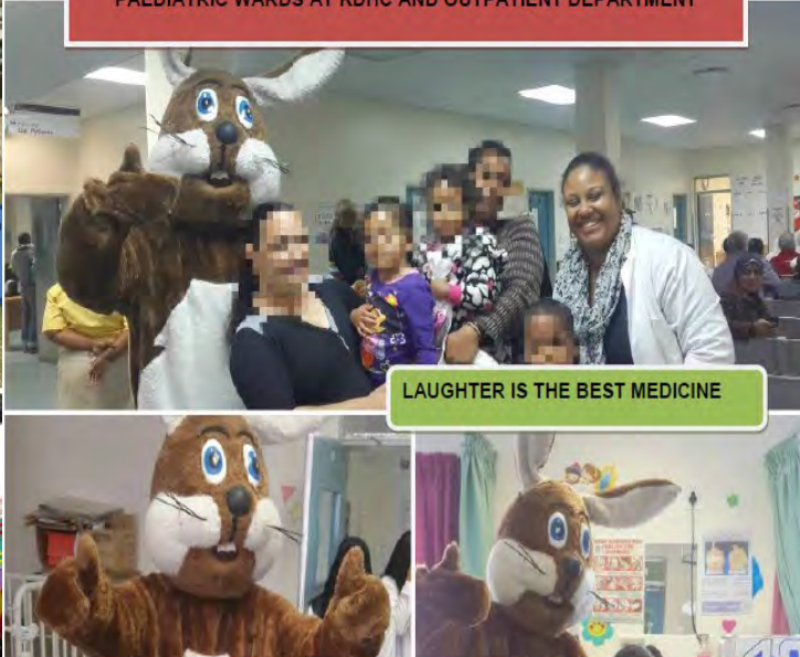
LAUGHTER IS THE BEST MEDICINE