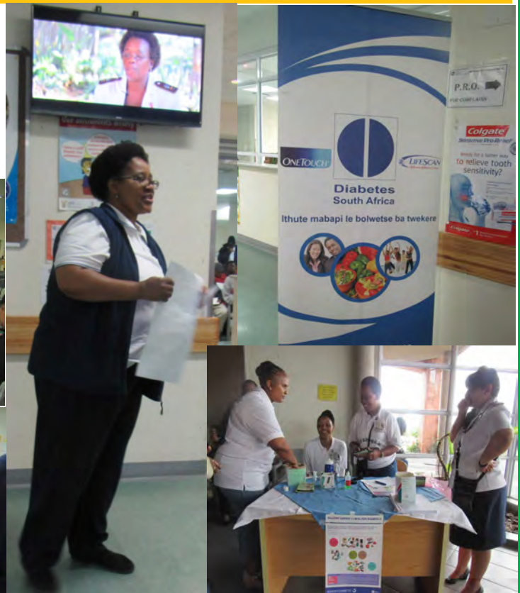
MOPD Staff members giving patients in-service training