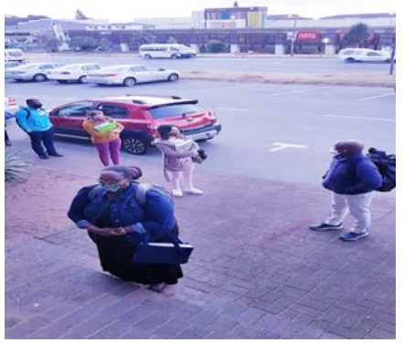
STUDENTS SOCIAL DISTANCING