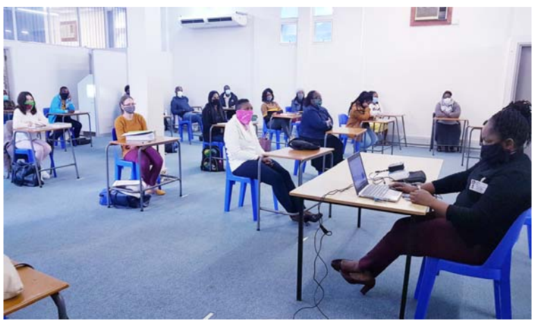
Students and campus staff attending in-service on covid19