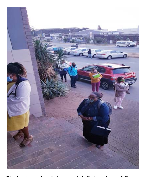
Students maintaining social distancing while waiting to be screened