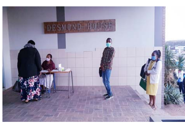
All students and employees screened at the campus screening area