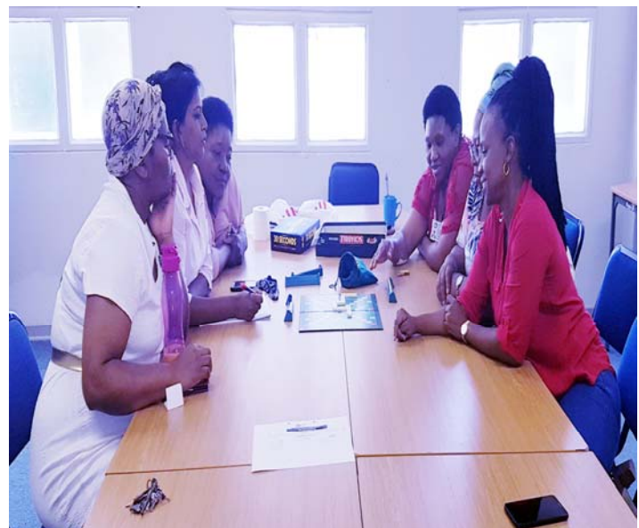
Indoor wellness activity for academic staff