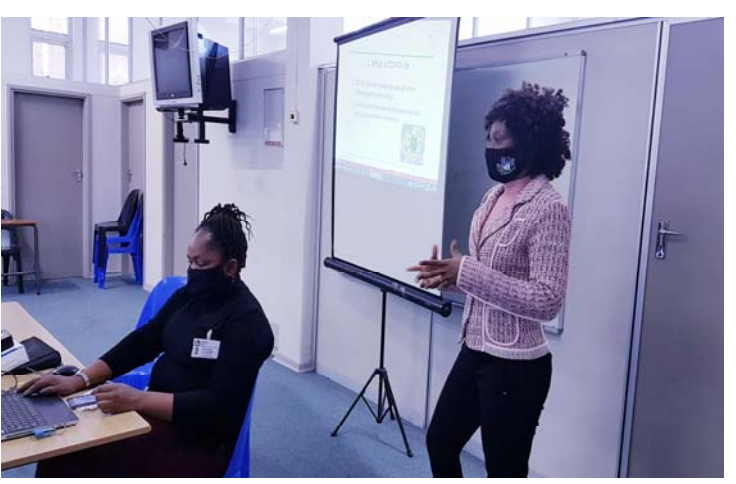
Trainers from the UGu District Office giving inservice to students and campus staff on covid19