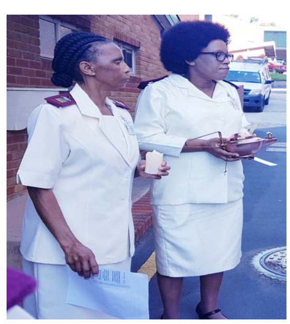
Mrs NG Cele addressed the staff on the meaning of the lamp