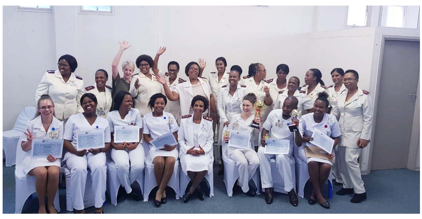
Staff, guests of honour and Award recipients during the buttoning and awards ceremony