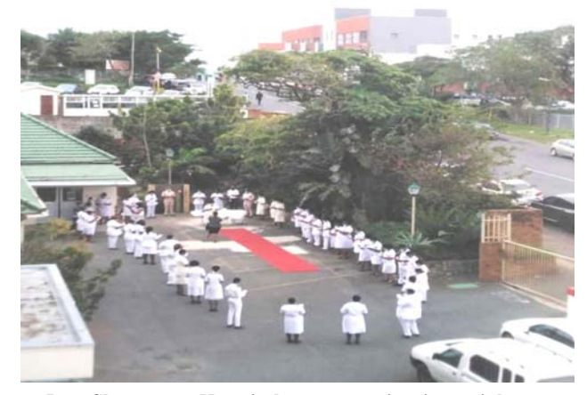
Port Shepstone Hospital nurses maintain social distancing at the Nurses' Day celebration