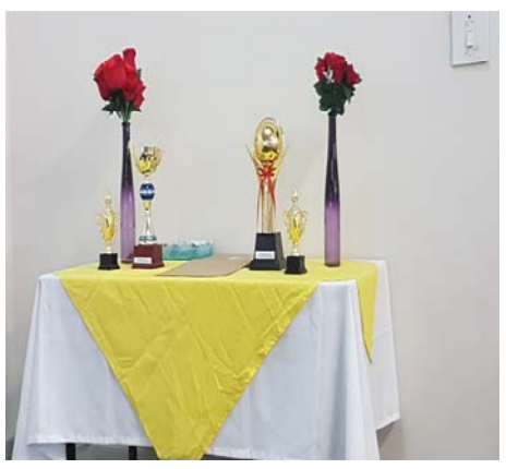
The trophies and certificates table