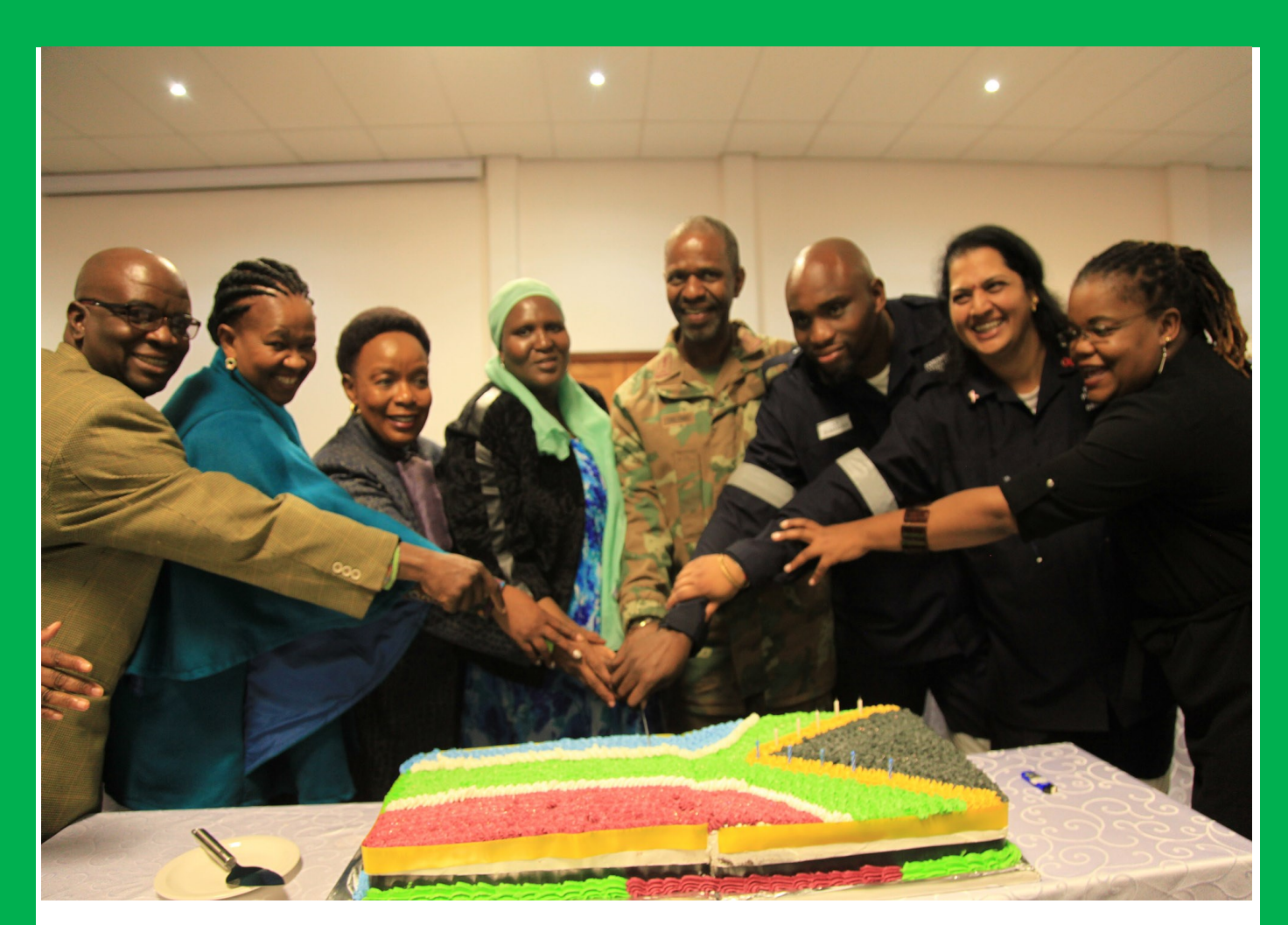
The cutting of the Cake!!!