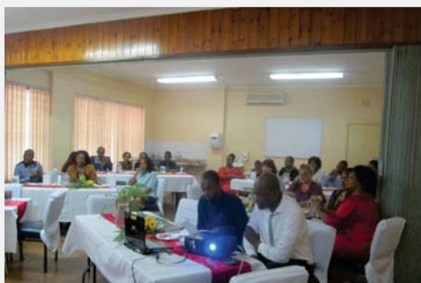
Bottom left: HR Staff

HR department staff gave feedback on their work progress in the previous year and their future plans for 2016.