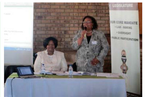
Ezakheni E NHI presentation... READ MORE ON PAGE 3