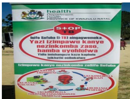
TB screening campaign... READ MORE ON PAGE 1