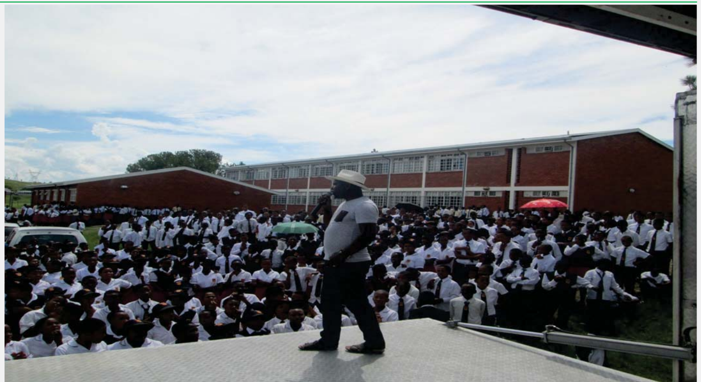
Steadville Secondary School pupils