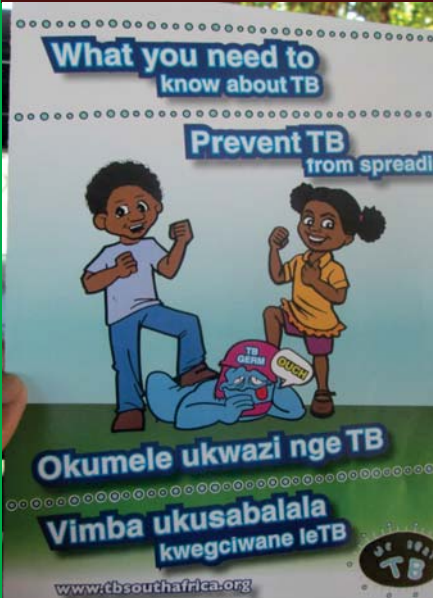
Distributed: TB educational pamphlets