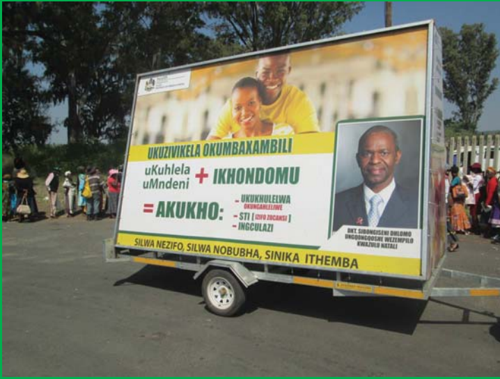
Mobilization trailer with Dual Protection and illegal abortion campaign on both sides.

Illegal abortion is one of the major problems faced by our youth. It is for this reason that the Department of Health (Ladysmith Hospital) has decided to go around the busy streets of Ladysmith and warn the community about the problems that come with trusting unprofessional doctors with one's life.