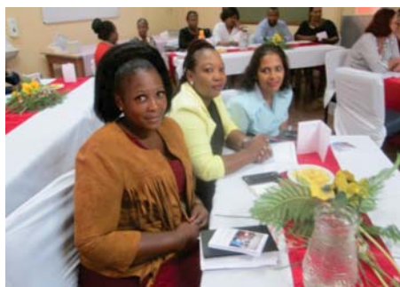
HRD Annual event... READ MORE ON PAGE 2