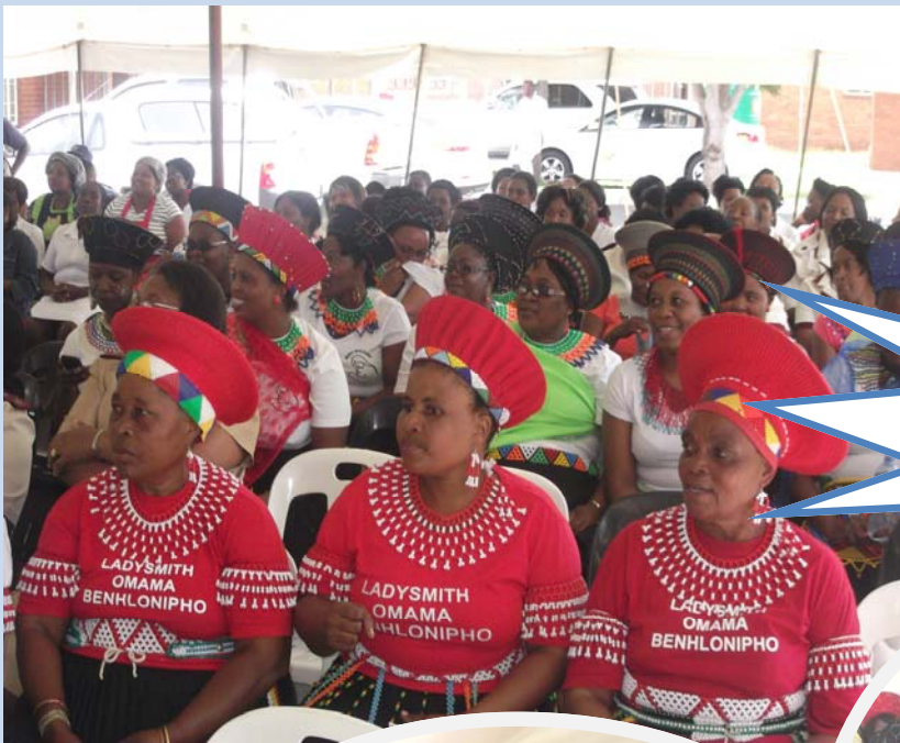
LADYSMITH OMAMA BENHLONIPHO AND WARD 9& 10 WERE ALSO THERE TO DO ZULU DANCE