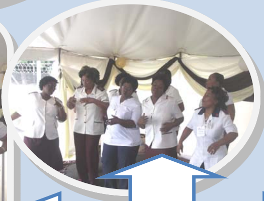
NURSES WERE DANCING LIKE CRAZY, LOL!!!