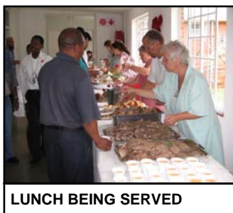
LUNCH BEING SERVED