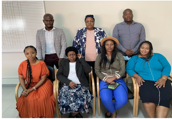
New Hospital Board