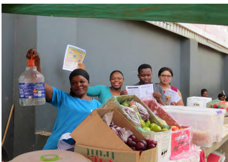
Skhemelele residents during the cholera campaign

Manguzi Hospital took it upon themselves to educate and create awareness about cholera in the community of Mhlabuyalingana. On the 27th of February Manguzi Team and environmental health practitioner went to Skhemelele and surrounding areas to speak with the street vendors, taxi owners and schools, pamphlets were given to clients. On the 2nd of March 2018 the campaign was held around Manguzi township.