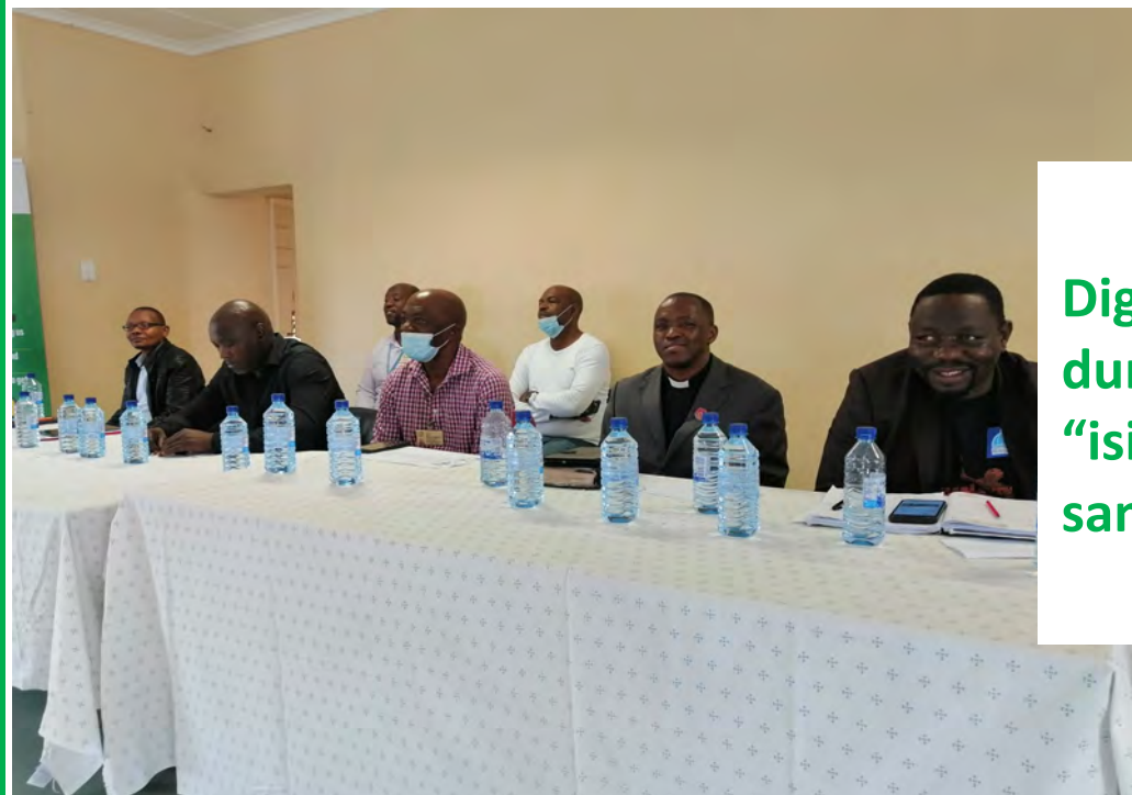
Dignitaries during the “isibaya samadoda” event