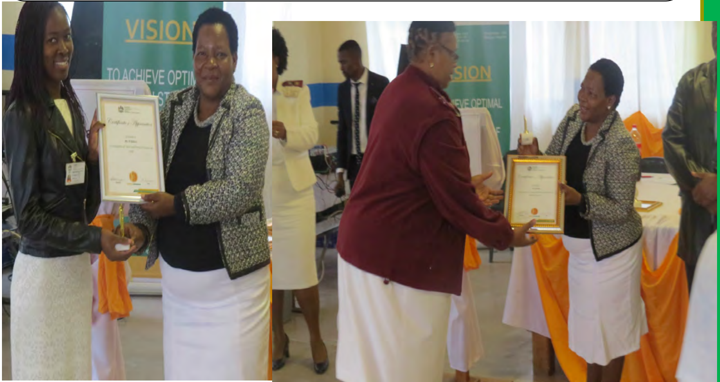
Staff receiving their awards