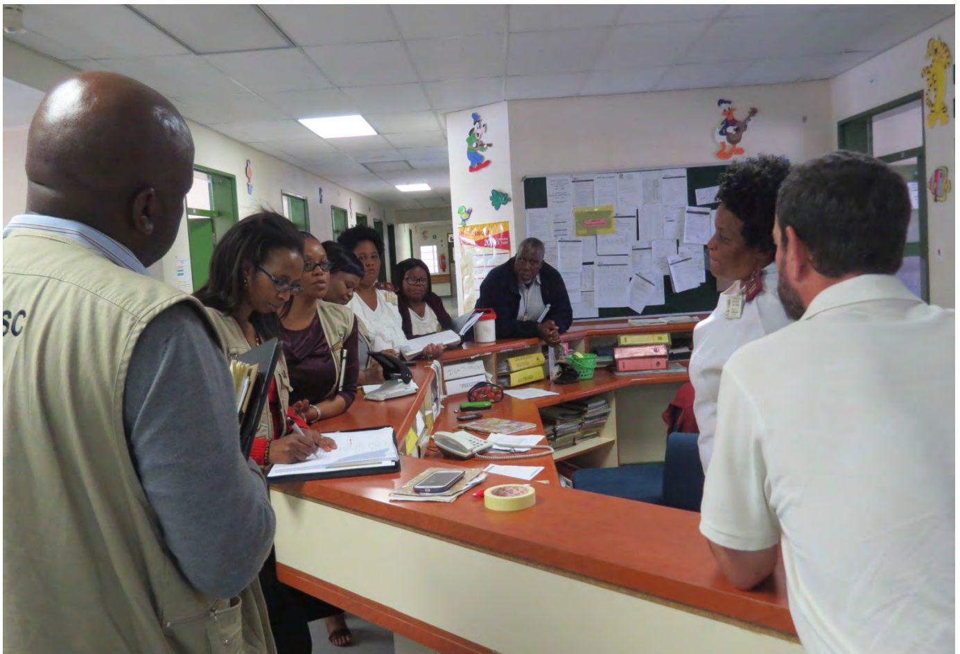
PSC Team at pediatric ward

Manguzi Hospital was fortunate to be visited by the Public Service Commission which is an institution aimed at promoting constitutionally prescribed values and principles governing public administration in the public service. On their visit on 08 June 2017 they took rounds around the Hospital and Wards interacting with the staff on issues like grievance procedure, Batho Pele, to name the few.