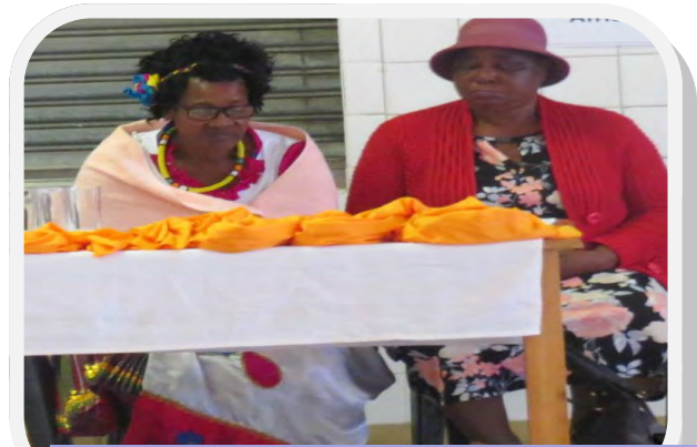
Manguzi Hospital management invited retired staff to celebrate with them during quality day. They were also awarded for their excellence during their working days.