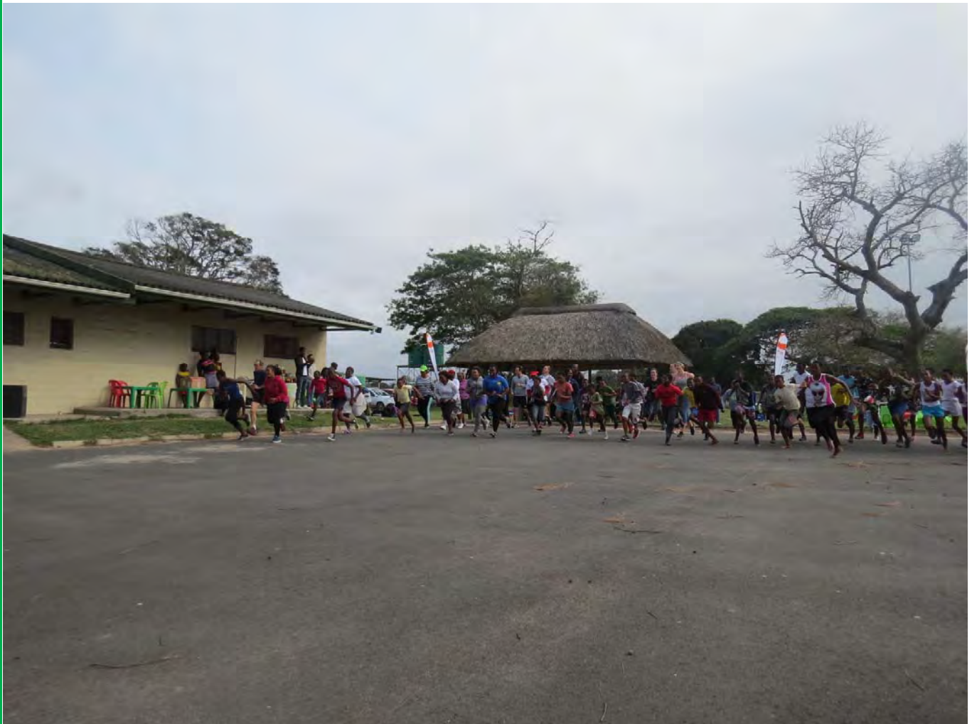
Participants during Gijima