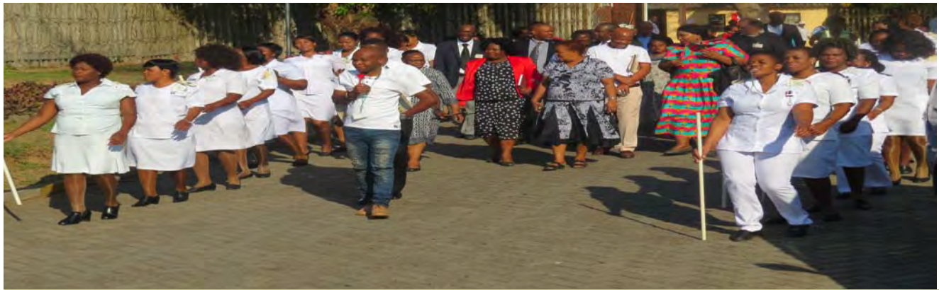
Manguzi Hospital team as they welcome the KZN Legislature

What an honour!, Manguzi Hospital will forever be appreciative of the visit by the high level of authority in the province.