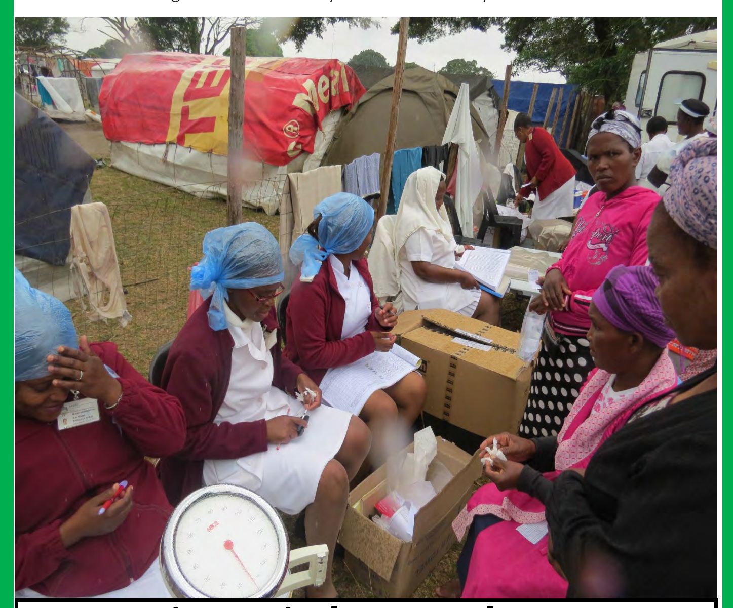
Manguzi Hospital outreach team at Thandizwe

Being a public servant is a calling indeed, it needs a lot of sacrificing and putting people first (one of Batho Pele principles),. Manguzi Hospital outreach team is always willing to serve the community of Mhlabuyalingana whether it is raining or not. In the photograph below, the hospital nurses were at Thandizwe during the visit of Inkosi yakwaShembe( Unyazi lwezulu).