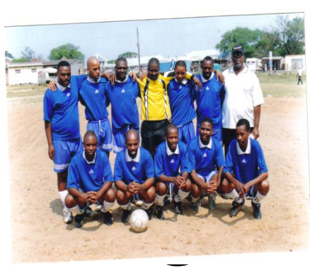
The best team in our Country and in our province.

Soccer. And there were prices to be won.