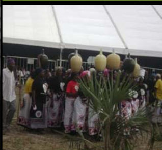
Special Tembe Traditional deligation taking ubuganu to InkosMabhudu Tembe