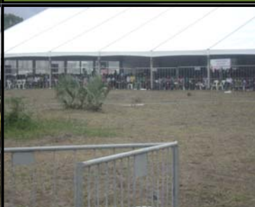
Thousands of people attended umthayi