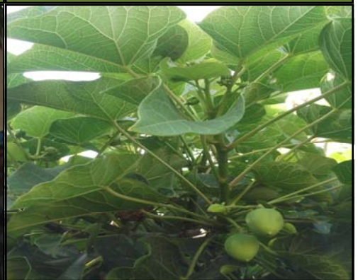
I-jatropa tree enezithelo