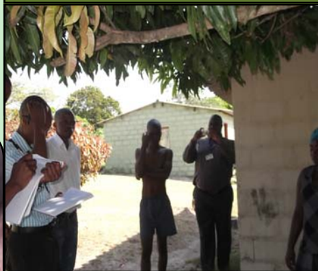
Medical students interview one of the family Whom their children eat the ripen fruit of jatropa