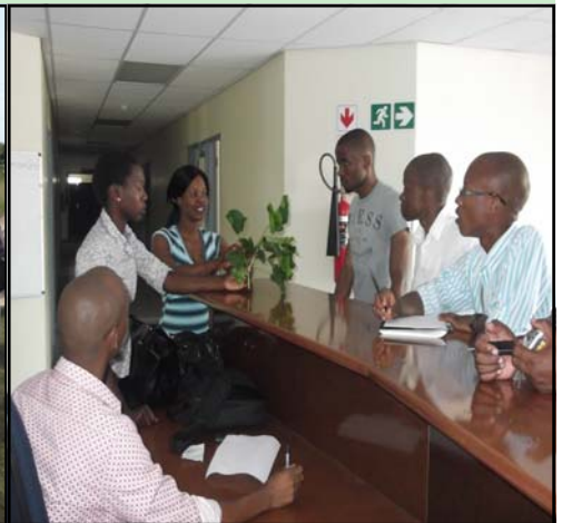
Interview session at agricultural offices to find out that ,are that aware about Jatropa