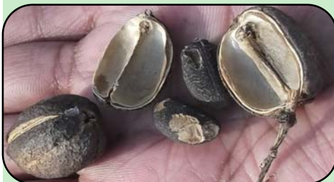
Imbewu edliwa abantwana ibukeka kanjena