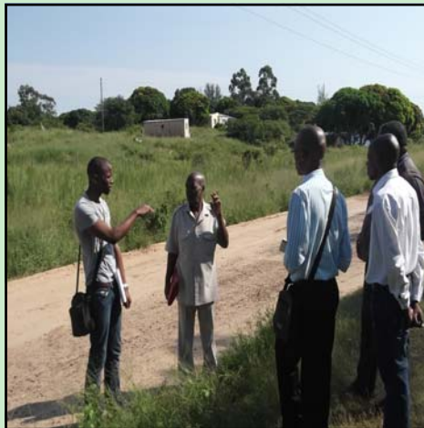
Medical team interviewing one of the community member who have this type of tree

through out the community and clinics so that everybody is made aware of this dangerous tree.