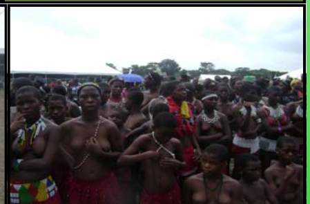
Tembe citizen attended umthayi