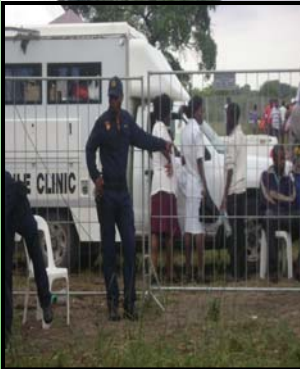
Manguzi Hospital staff Providing clinical service