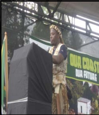
King Mabhudu Tembe addressing the crowd