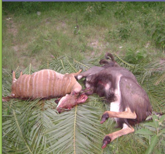
Izinyamazane lezi okwengezwa ngazo inyama phezu kwezinkomo ezimbili zomcimbi ezazinikeliwe.