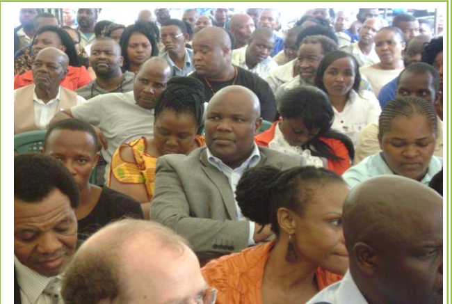
Dignitaries and staff members listening to the progress of the Service excellence Awards 2012 function at Manguzi Hospital