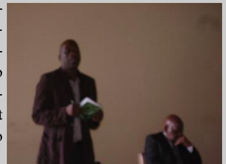
MANGUZI HOSPITAL CEO ADDRESSING THE TRADITIONAL COUNCIL.