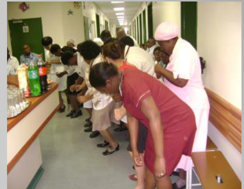
PEDIATRIC WARD STAFF SINGING AND DANCING IN THE LAUCH OF NEW PEDIATRIC WARD

for their cooperation to make this ward to be in high class. To all our staff we wish you all the best to your new ward and we say keep on working hard as you did in old Peads ward.