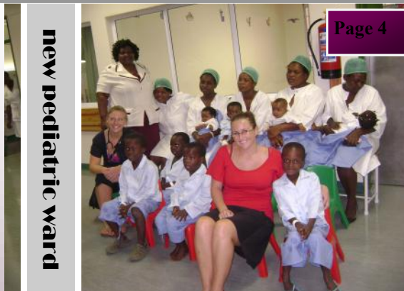
new pediatric ward