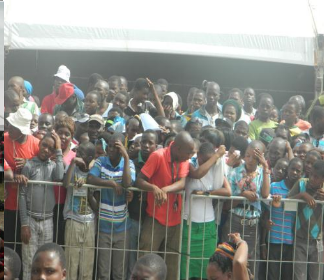
A. AMABUTHO OF INKOSI M I TEMBE ENTERING AT UMTHAYI FESTIVAL SPOT