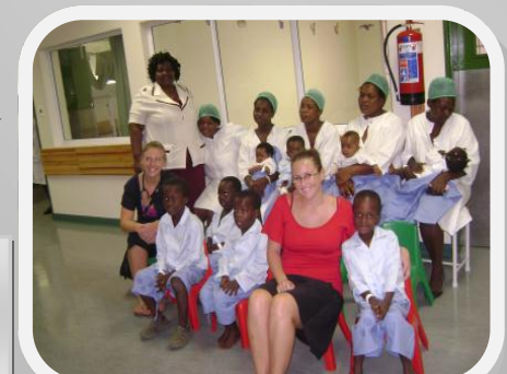
Bottom Right: Nurse, patients and doctors in the launch of new pediatric ward