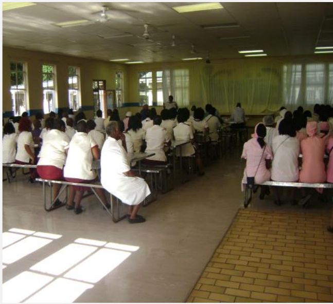
Manguzi Staff Members Listening To The Presentation Of Batho Pele Principles At Dining Hall In Their Meeting That Was Held With Hospital Managers And Operational Managers