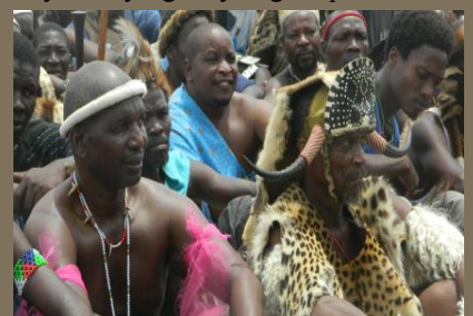
Amabutho asebukhosini bakwaTembe

Inkosi MI Tembe ithe ngalomcimbi bafisa ukuthuthukisa ezokuvakasha kanye nobumbano namazwe angomakhelwane okubalwa kuwo iMozambique, Swaziland kanye ne South Africa. Uqhube wathi ngalomcimbi sekusungulwe uMthayi soccer Challenge Cup eyandulela wona lomcimbi okwenza intshayayo ibe yingxenye ngokuphele.