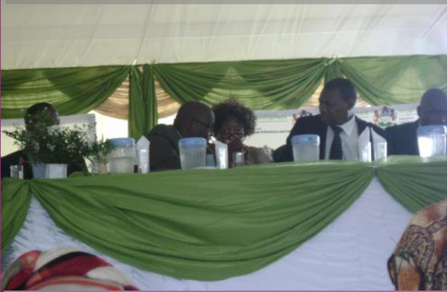
Premier minister Dr Zweli Mkhize and MEC Weziwe Thusi with other dignitaries at the recent imbizo at esicabazini