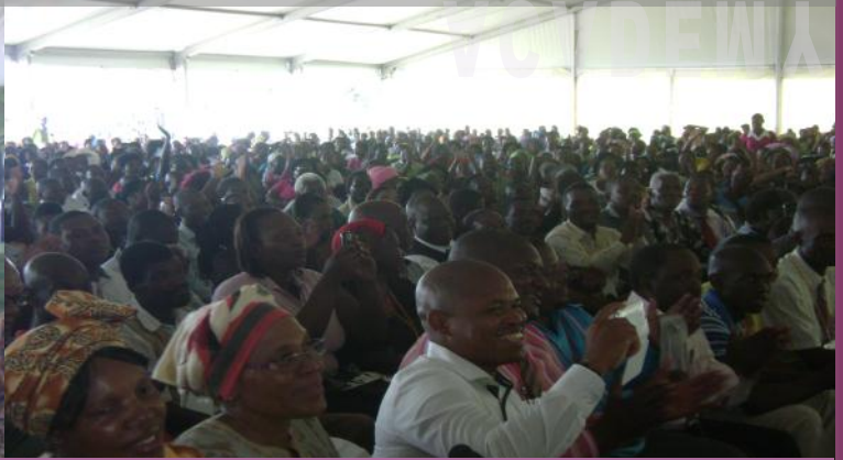
Community members enjoying the day at the imbizo at esicabazini

Kuningi intsha ehlala ikhala ngakho kuHulumeni ukuthi ayikwazi ukuzithuthukisa ngezindlela eziningi, kungaba amakhono, emanyuvesi ayithathwa, ayiqashwa ngendlela nasezi mbonini, okwenza izizwe ikhathazekile ngekusasa layo, iyo futhi intsha evamise ukutholakala isebenzisa izidakwamizwa, uphuzo oludakayo nokunye, okwenza ilahlekelwe yisimilo nekusasa elihle.