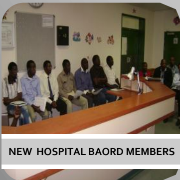
NEW HOSPITAL BAORD MEMBERS

After many years striving for New Pediatric Ward due to some contradictions about the structure and buildings of the ward we are happy that on the 13 th march 2013 we have launched a New Peads Ward.