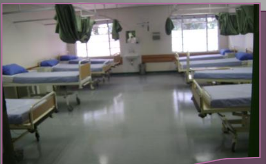
Bottom Left: New pediatric ward beds