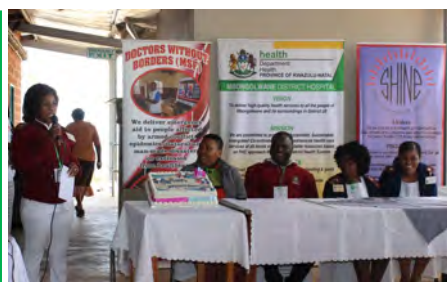
Annual ART Children's club Christmas party ..... READ MORE ON PAGE 4