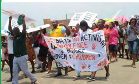
16 days of activism commemoration ..... READ MORE ON PAGE 3