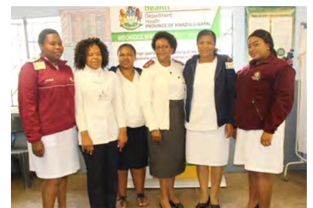
Cervical cancer screenings ..... READ MORE ON PAGE 5