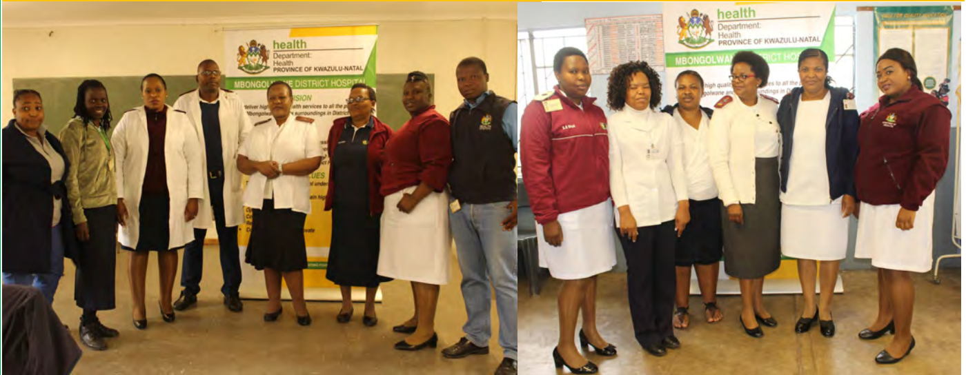
Officials during cervical cancer screening awareness at Masundwini & Ngilandela areas

A ccording to World Health Organization, cervix is the narrow part of the lower uterus that connects to the vagina, often referred to as the neck womb. Cervical cancer is an abnormal growth of cells of the cervix. The abnormal cells, sometimes called pre-cancerous tissue, further develop as cervical cancer. Types of cervical cancer :